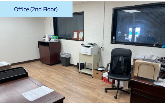
Office (2nd Floor)