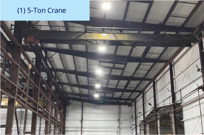
(1) 5-Ton Crane