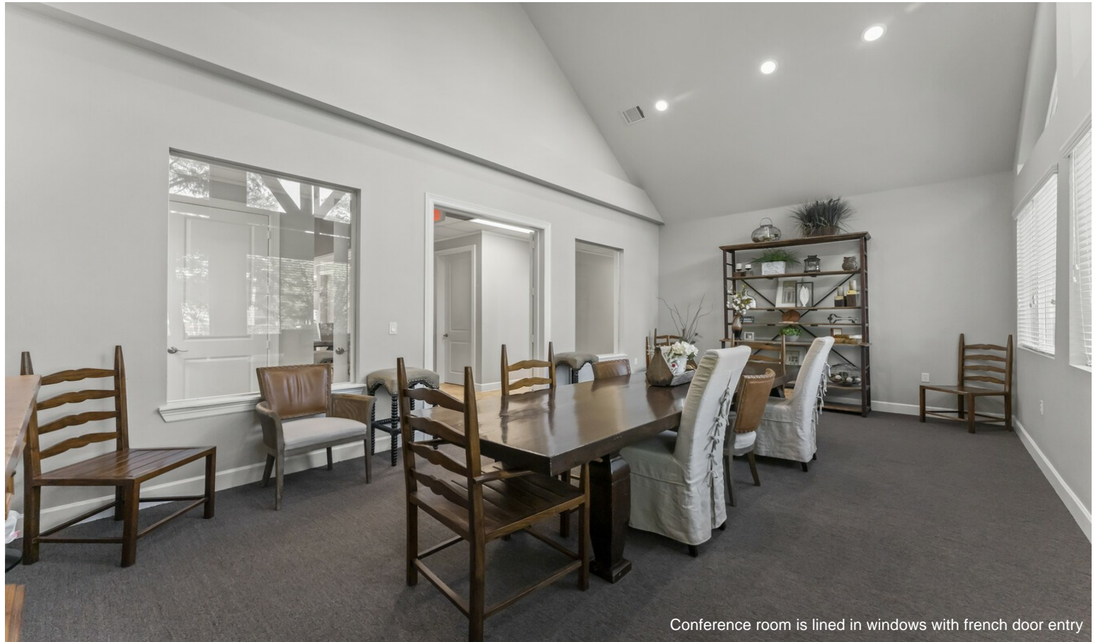
Conference room is lined in windows with french door entry