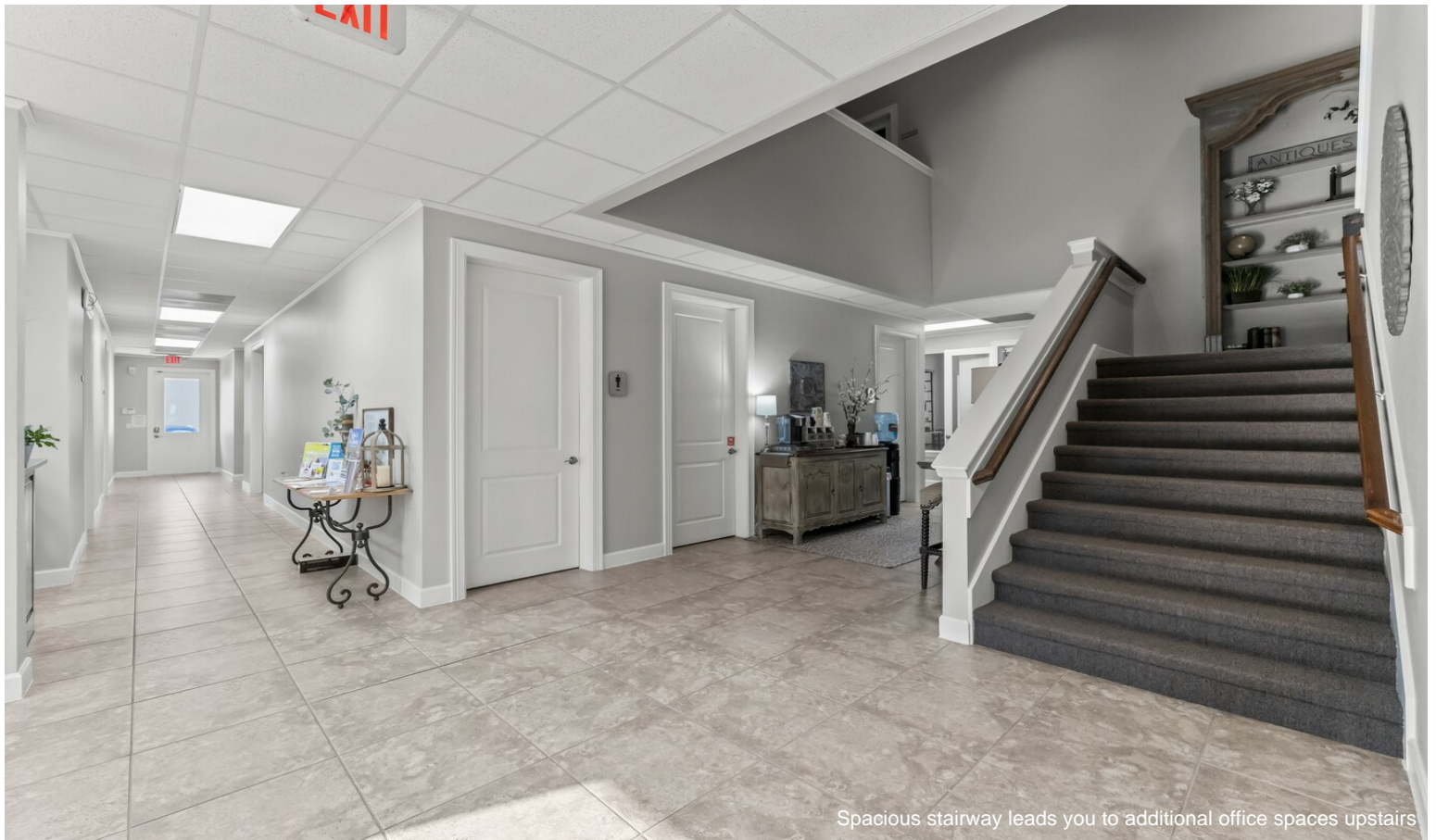
Spacious stairway leads you to additional office spaces upstairs