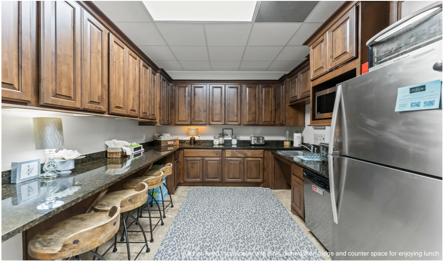
Kitchen lined in cabinetry with sink, dishwasher, fridge and counter space for enjoying lunch