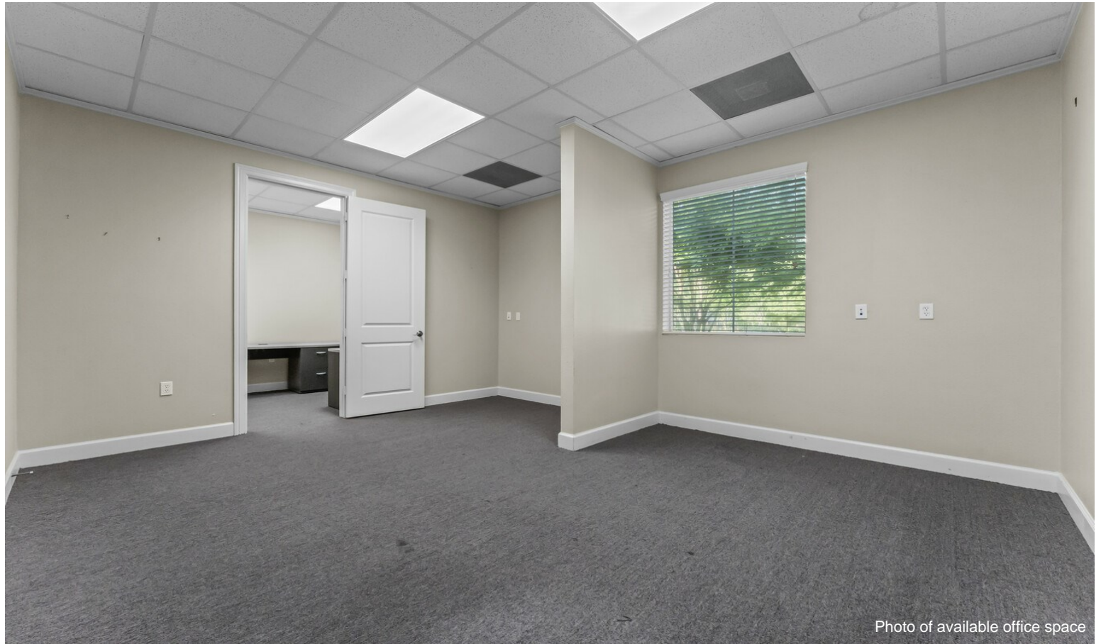
Photo of available office space