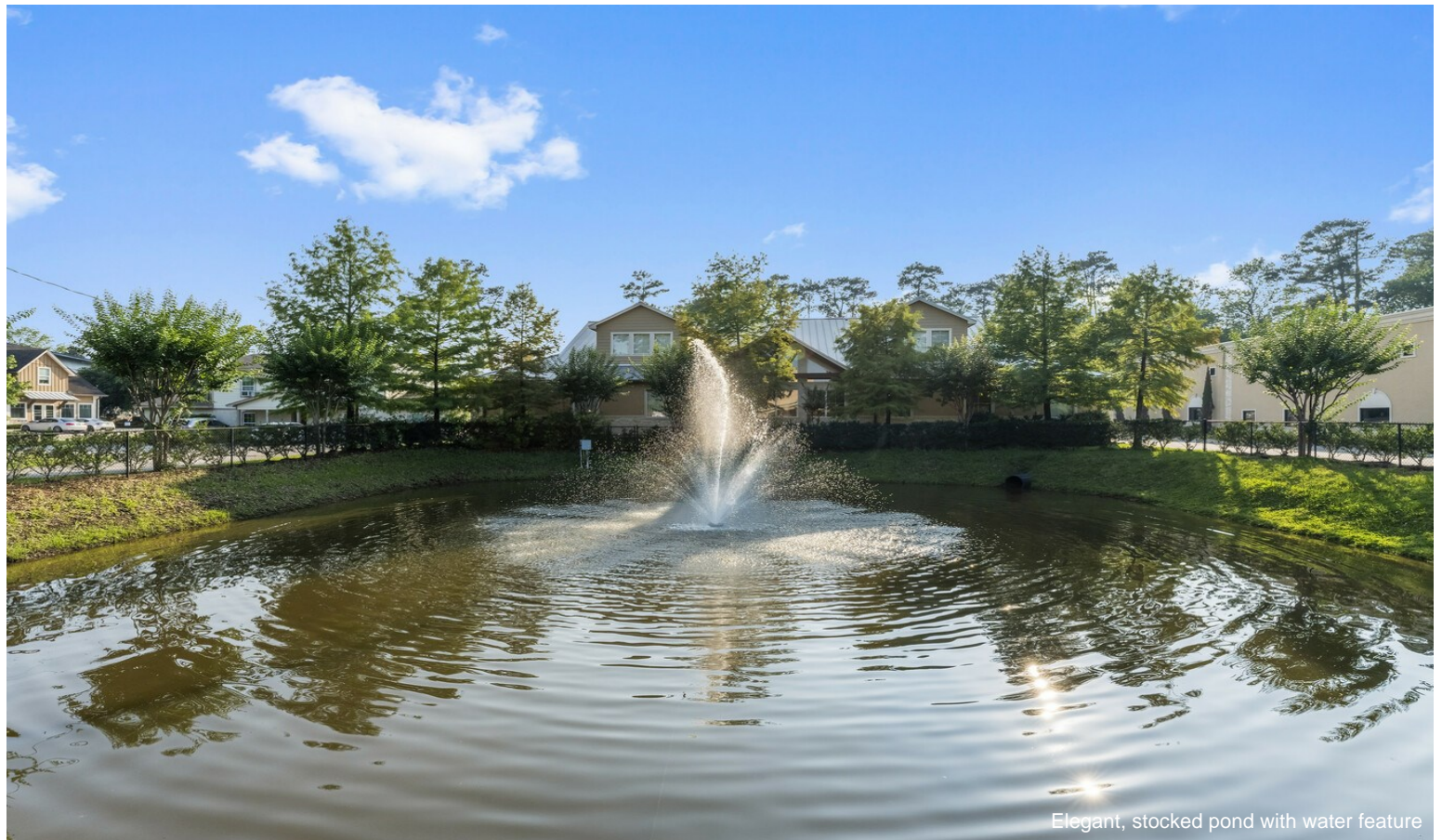
Elegant, stocked pond with water feature