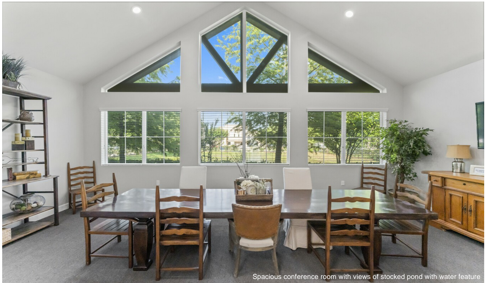
Spacious conference room with views of stocked pond with water feature