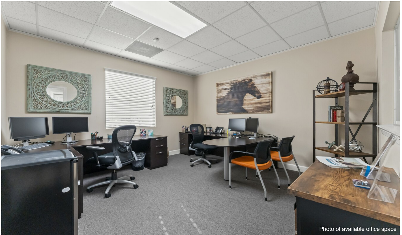
Photo of available office space