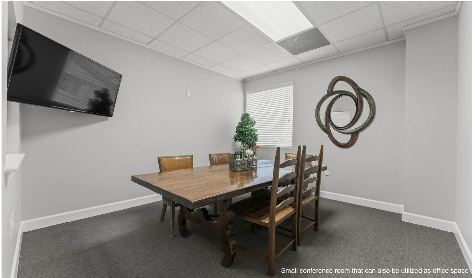
Small conference room that can also be utilized as office space