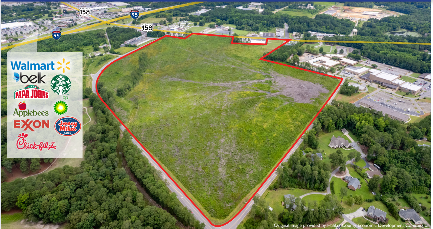
Original image provided by Halifax County Economic Development Commission.

No warranty or representation (express or implied) is made as to the accuracy or completeness of the information set forth herein. All information is submitted subject to errors, omissions, change of price, prior lease or sale, and withdrawal without notice. All marketing material produced by the Meridian Realty Group is proprietary. Any reproduction is expressly prohibited.