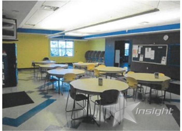
Breakroom with personal phone banks