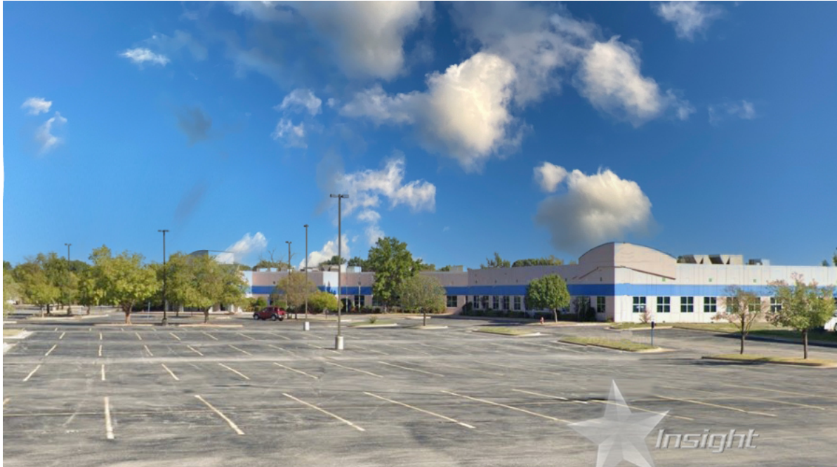
Front view from parking lot