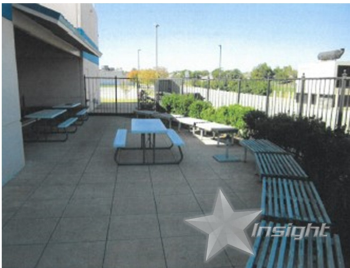
Outdoor break area