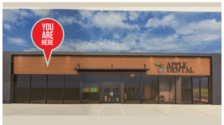
Rendering New Facade