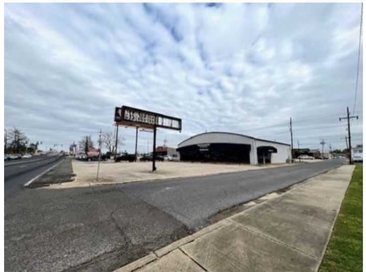
Front Corner Bridge St/Cotton St