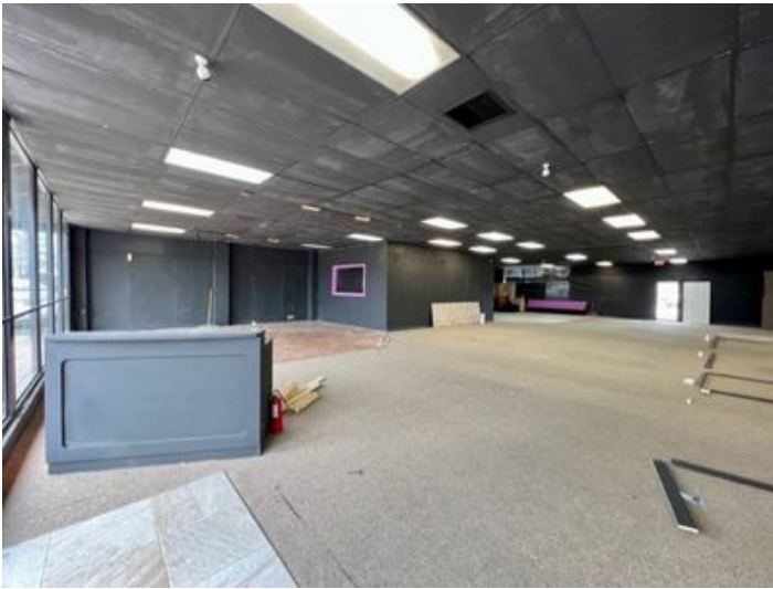
Open Floor Plan