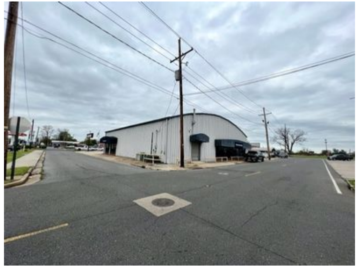
Rear Corner Cotton St/Mill St