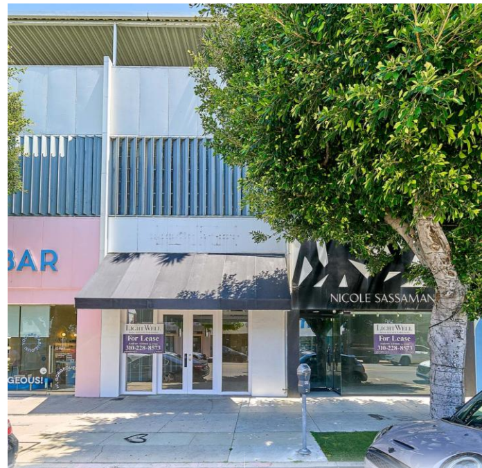
PRIME BEVERLY HILLS/WEHO ADJACENT