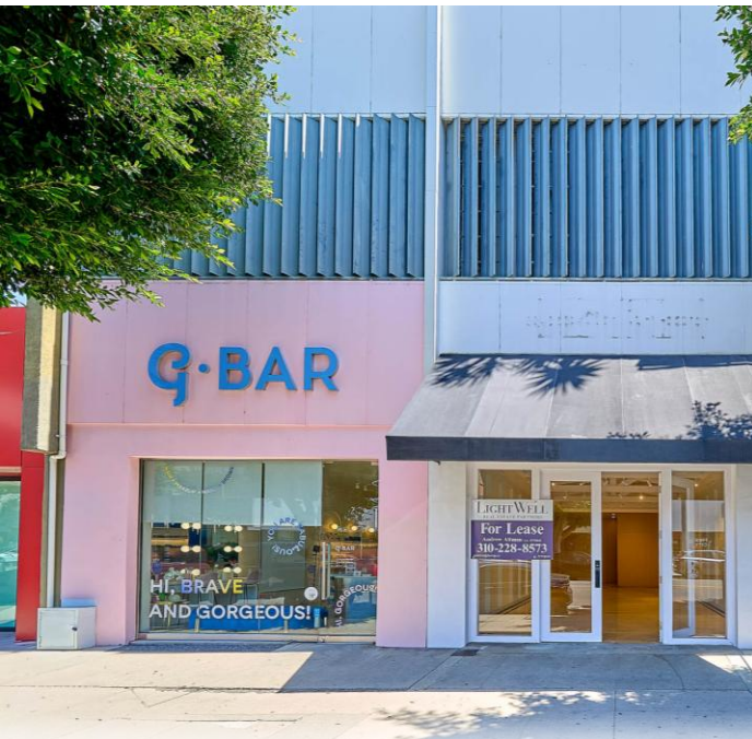
112-122 S ROBERTSON BOULEVARD