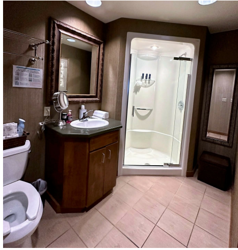
Restroom W/ Shower