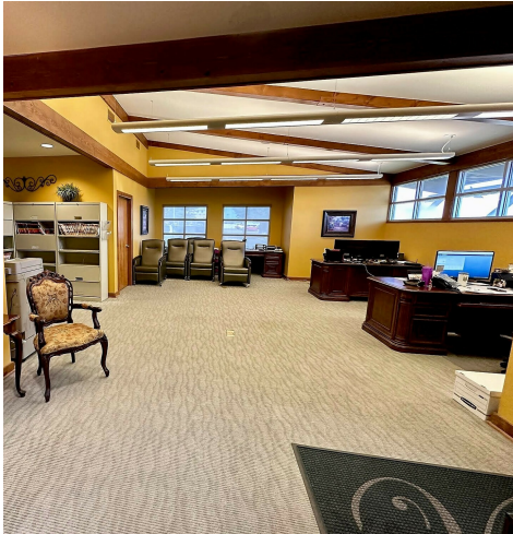
Open Work Area

GAUT·WHITTENBURG·EMERSON Commercial Real Estate COM SIOR