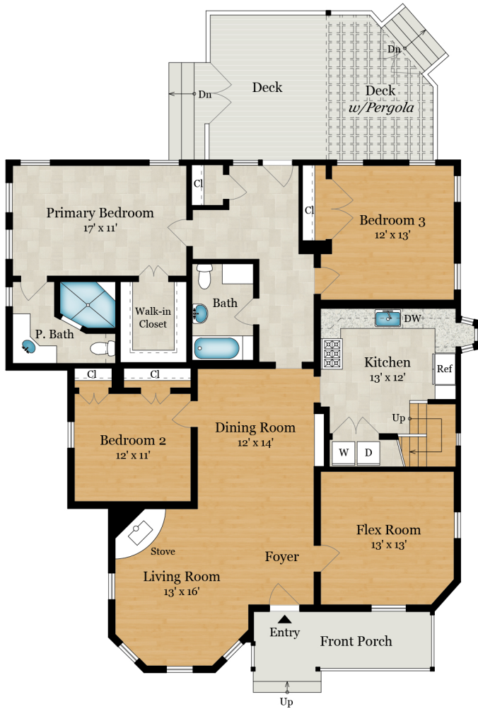
MAIN RESIDENCE MAIN LEVEL 1,855 SQ FT