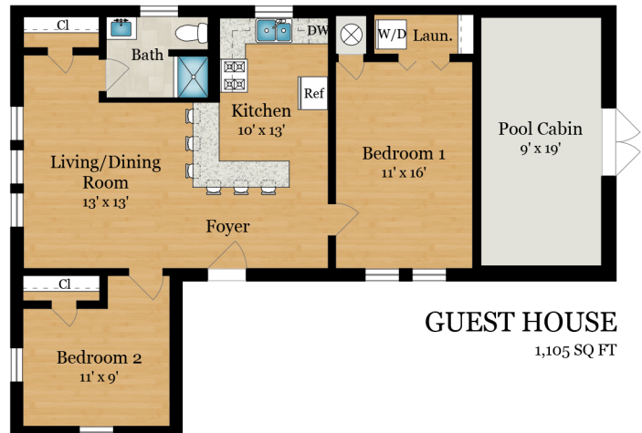
GUEST HOUSE 1,105 SQ FT