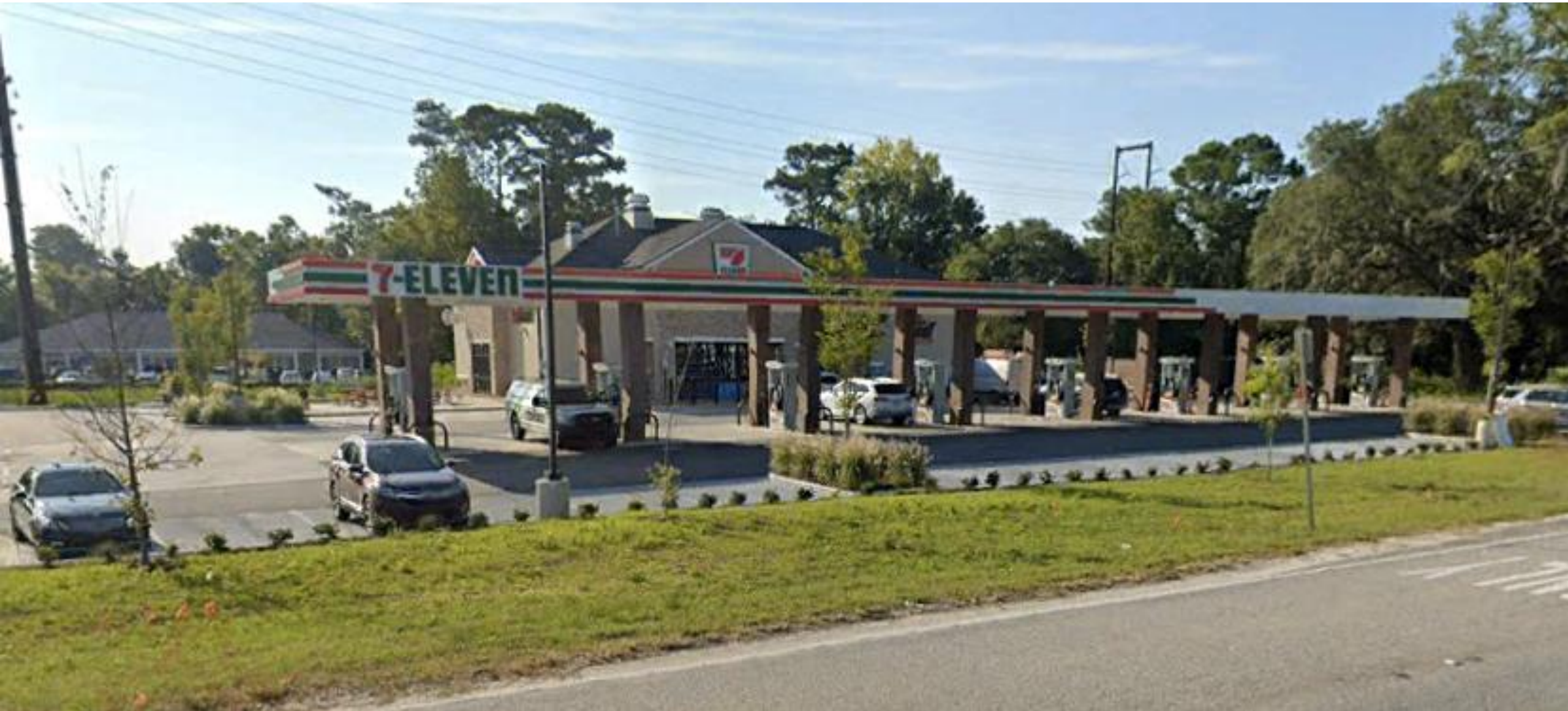
New 7-Eleven on the corner