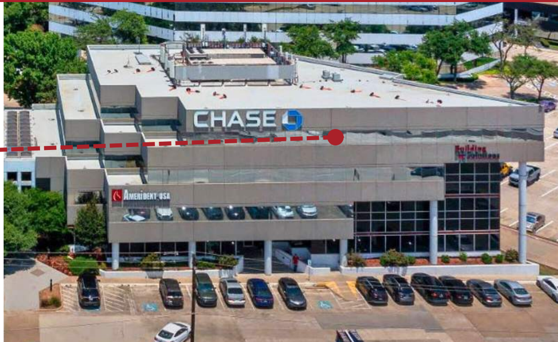
SUITE 410 (4TH FLOOR)

RENTABLE AREA : 5,972 SF COMMON AREA : 672 SF TOTAL SF : 6,644 SF