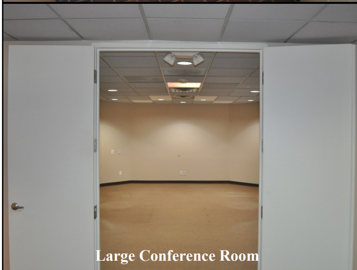
Large Conference Room