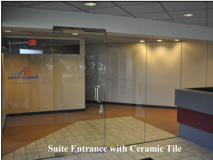
Suite Entrance with Ceramic Tile