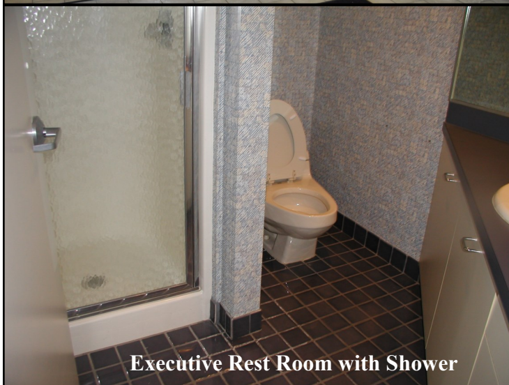
Executive Rest Room with Shower