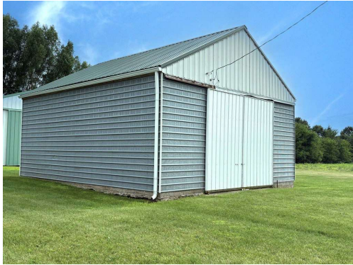
Metal Corn Crib 812 SF (29'x28') 13' Clear 1 Sliding Door (14'x13') Pitched Roof