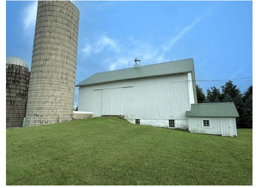
Metal Clad Barn Cattle Pens / Hay Loft 3,760 SF (40'x27') 3 Sliding Doors (1) 14'x16' (2) 10' x 7'