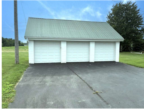
Garage 3 Car 609 SF (29'x21') OH Doors w/ Openers Pitched Roof