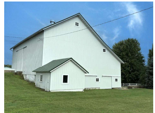
Metal Bldg. Milk House 169 SF (13'x13') 8' Clear 1 Man Door Pitched Roof