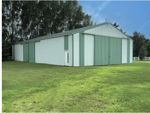
Metal Building / Equip. Storage 3,645 SF (81' x 45') 14' Clear 2 Sliding Doors (20'x14') Pitched Roof