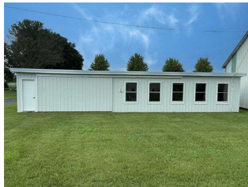
Metal Bldg. Chicken Coop 1,000 SF (50'x20') 6-8' Clear 1 Sliding Door (15'x7') Pitched Roof