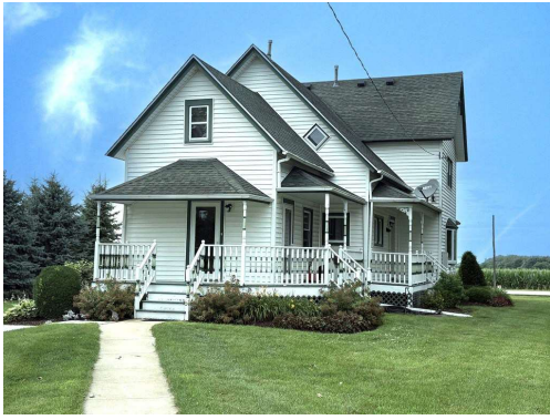
Residence 2-Story Plus Basement 2,382 SF Outdoor Concrete Patio 4 Bedroom / 1 Bath