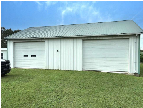
Metal Bldg. Office / Storage 1,550 SF (50' x 31') 12' Clear 2 Sliding Doors (14'x12') Pitched Roof