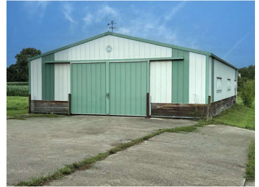
Ancillary Cattle Metal Barn 1,944 SF (54' x 36') 12' Clear 2 Sliding Doors (15'x10') Pitched Roof