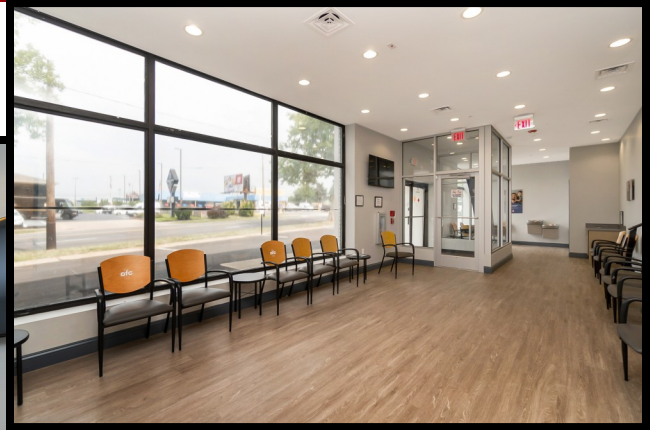
Waiting Room Reception desk with office, break room and office bathroom.