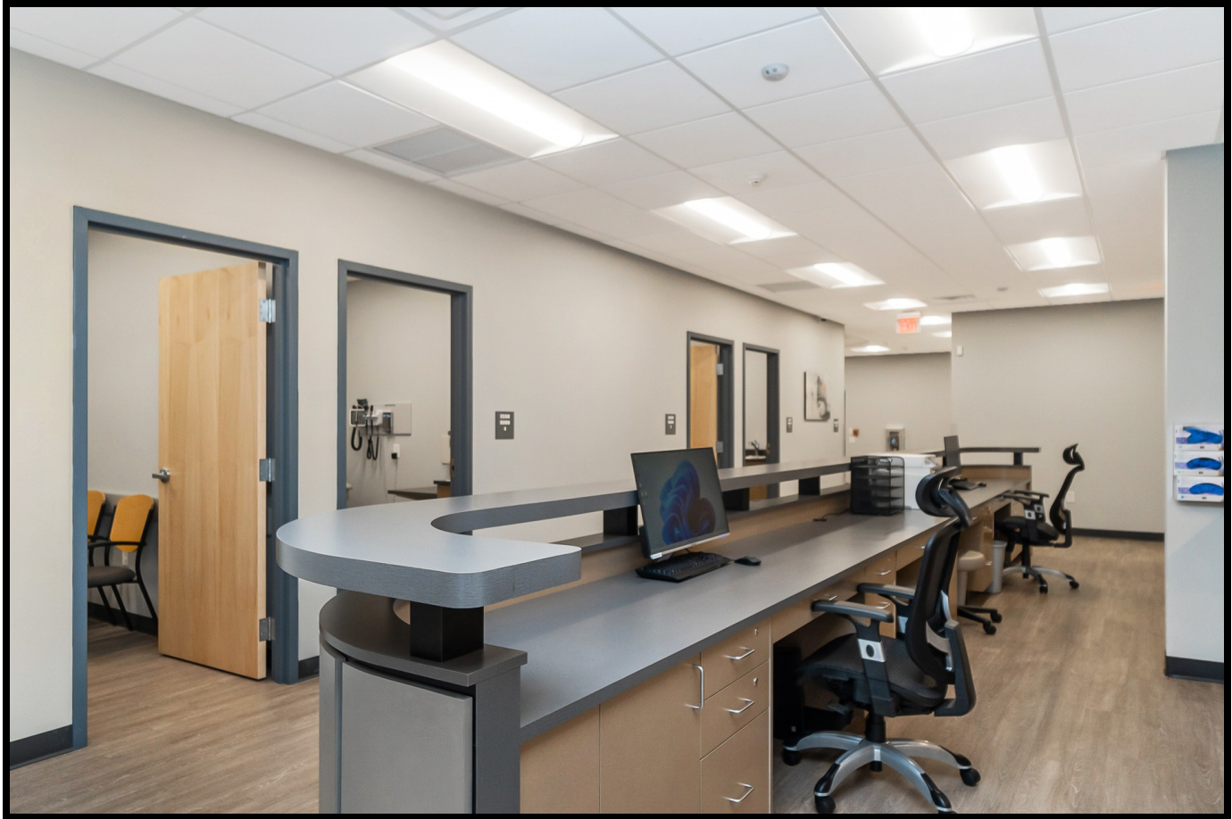
Nurses station with work area & Exam rooms