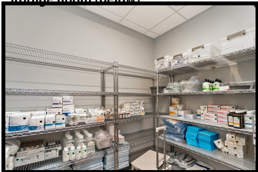
Storage Room (below)