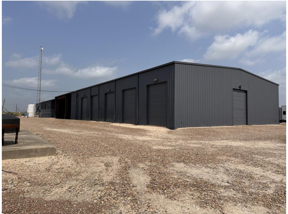
REAR SHOP EXTERIOR 12 - 12' x 16' OH Doors