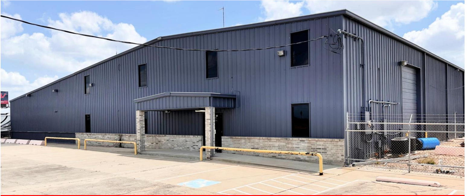
INDUSTRIAL WAREHOUSE WITH HIGH VISIBILITY IN RAPIDLY GROWING AREA ALONG IH 69