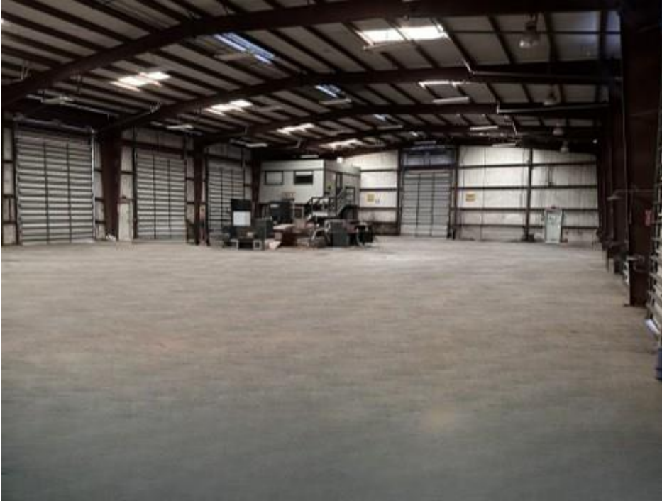
REAR SHOP INTERIOR