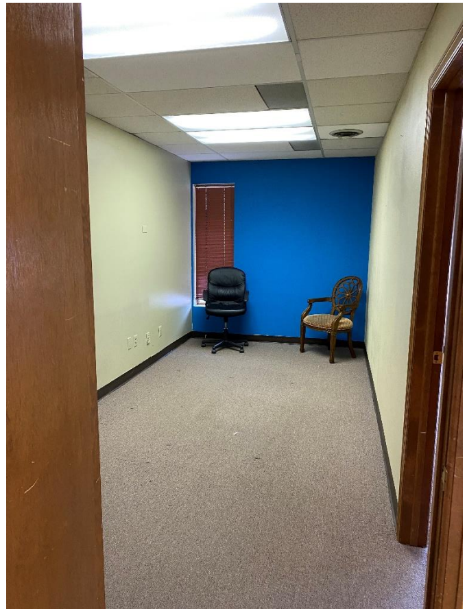
Second, smaller space with privacy door