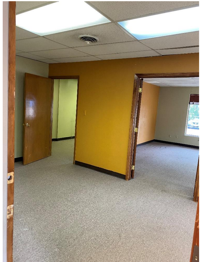
Front section / Entry / Reception