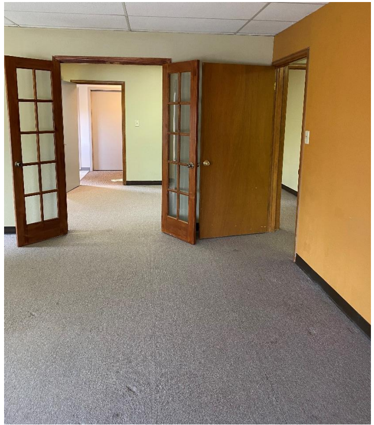
Large, open space separated by French doors