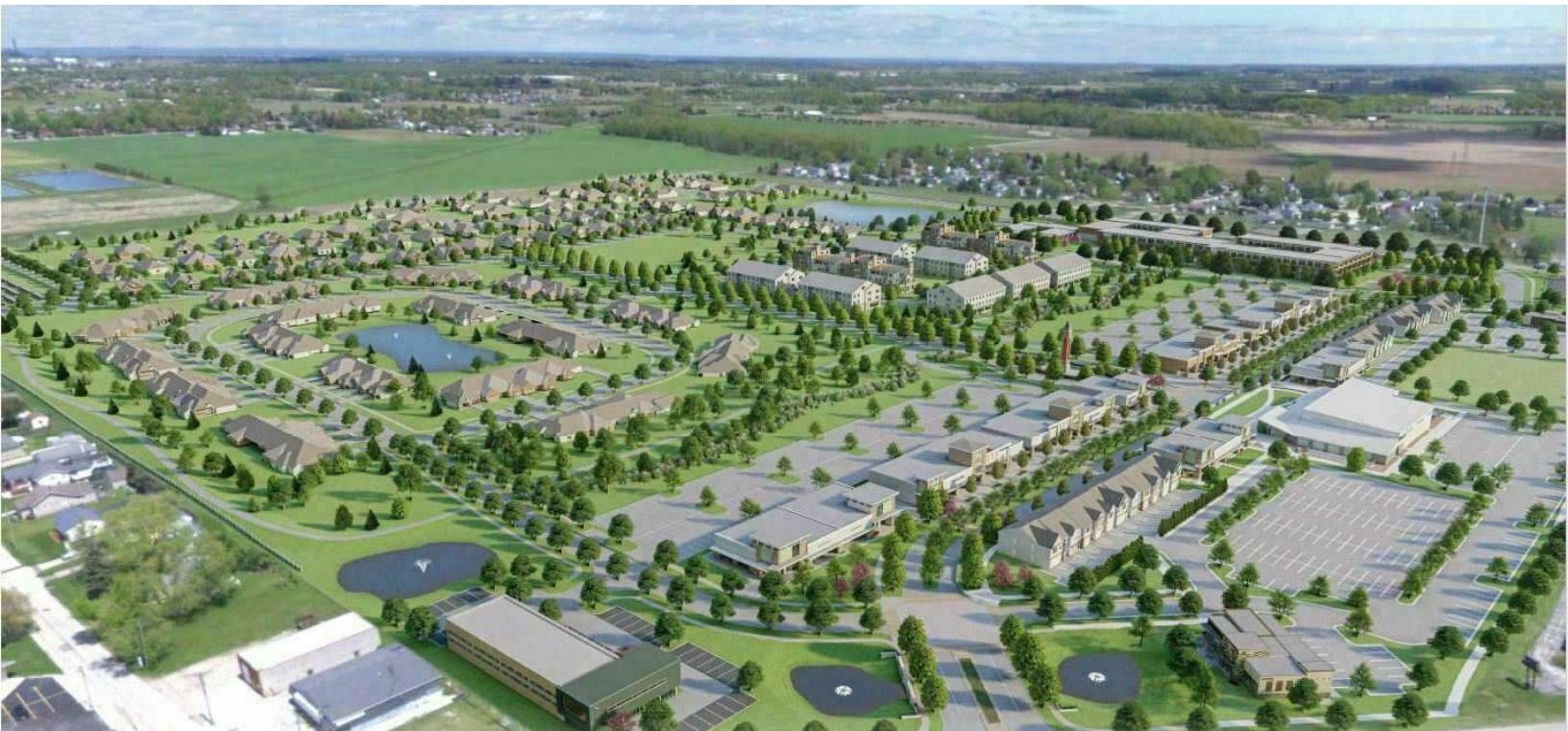
'The Enclave' - Mixed-Use Development Under Construction