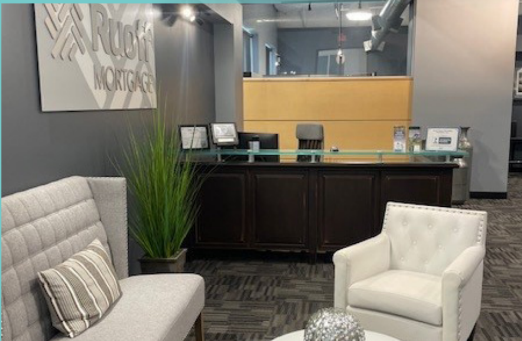
2,225 SQUARE FEET