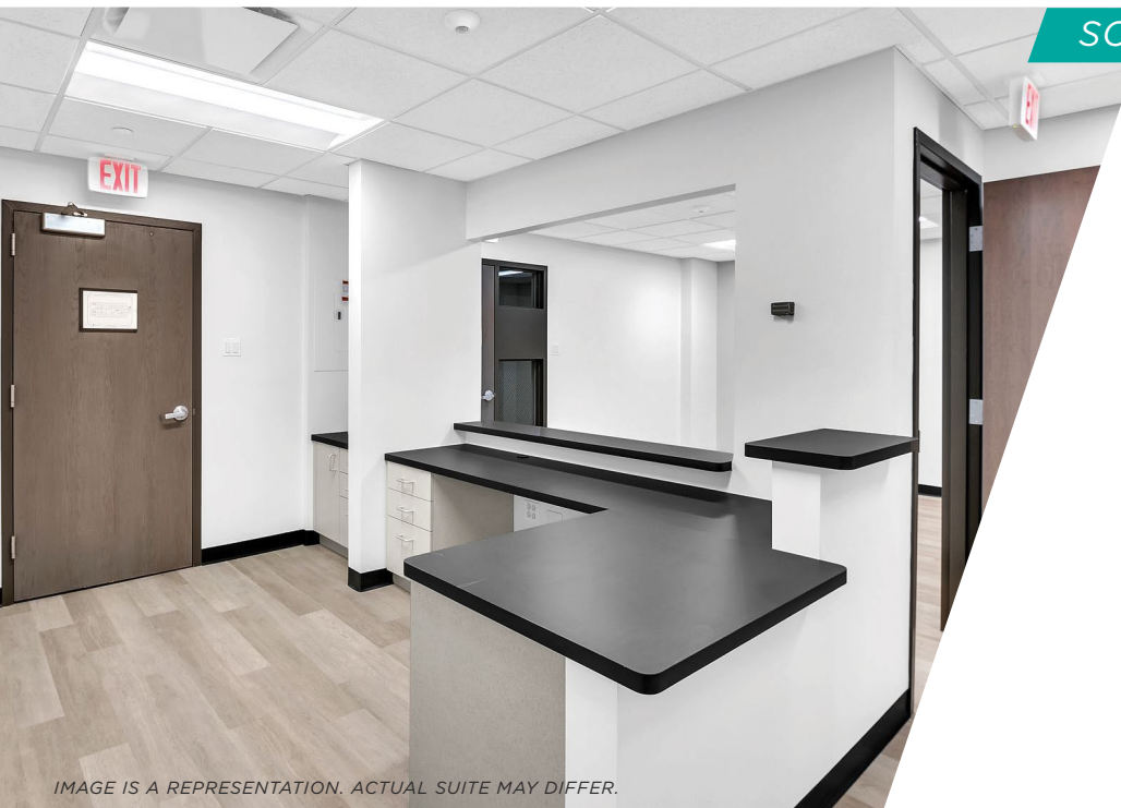
IMAGE IS A REPRESENTATION. ACTUAL SUITE MAY DIFFER.

Our SPEC suites combine convenience and quality in one perfect package. With sleek, modern finishes already in place, these suites are designed to be fully operational as soon as you move in. Skip the hassle and delays of construction and permitting —just move in and start seeing patients!