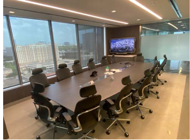
Large conference room