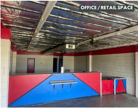
OFFICE / RETAIL SPACE