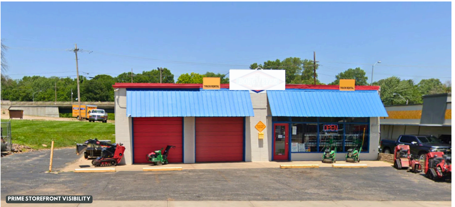
PRIME STOREFRONT VISIBILITY