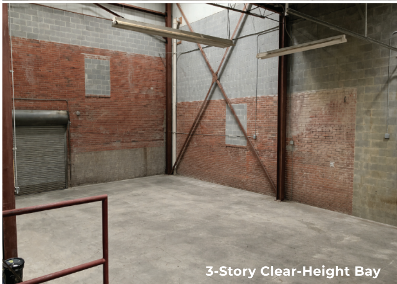
3-Story Clear-Height Bay