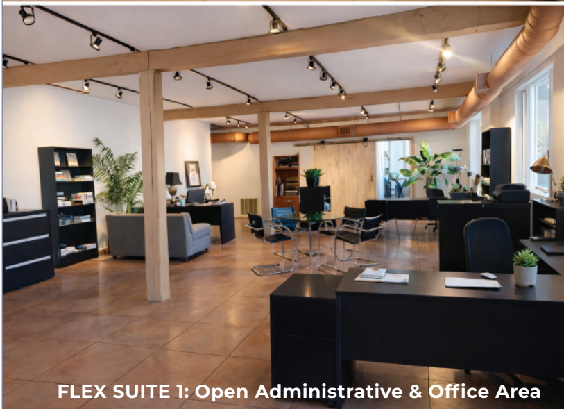
FLEX SUITE 1: Open Administrative & Office Area