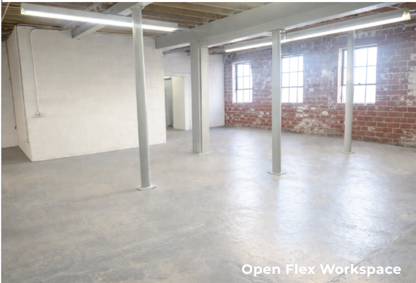
Open Flex Workspace