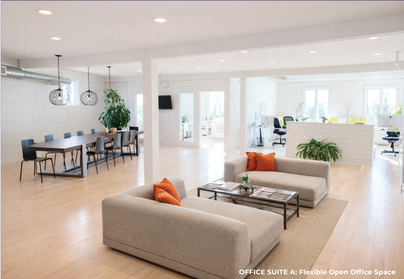
OFFICE SUITE A: Flexible Open Office Space