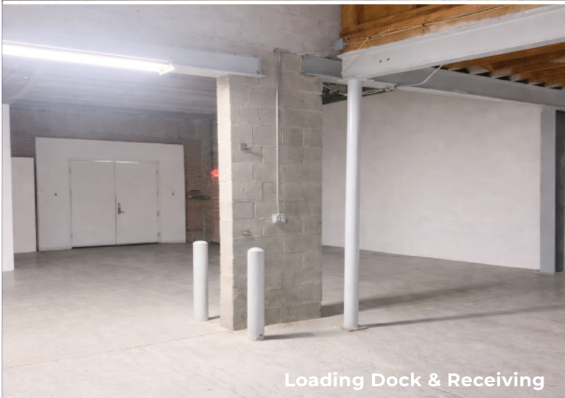
Loading Dock & Receiving