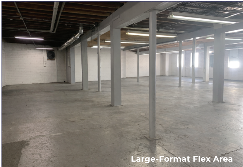
Large-Format Flex Area