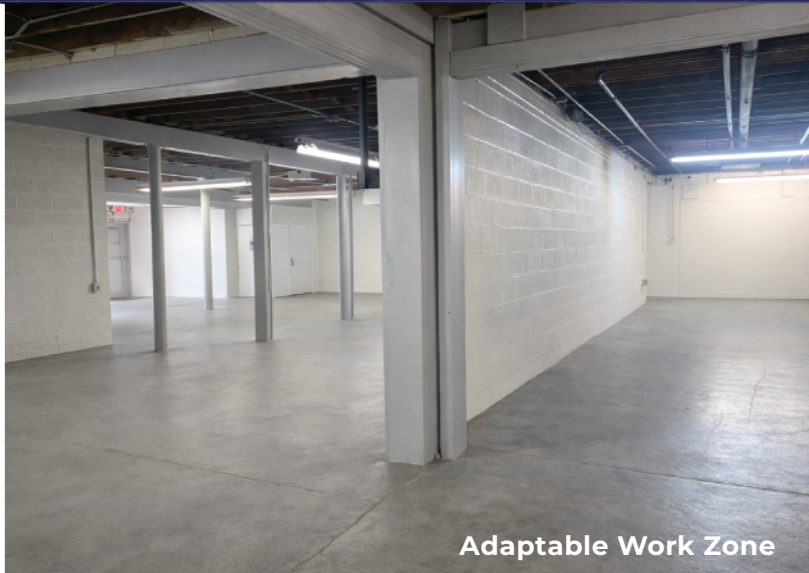
Adaptable Work Zone