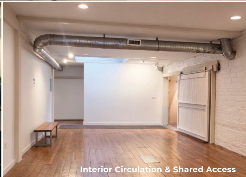
Interior Circulation & Shared Access