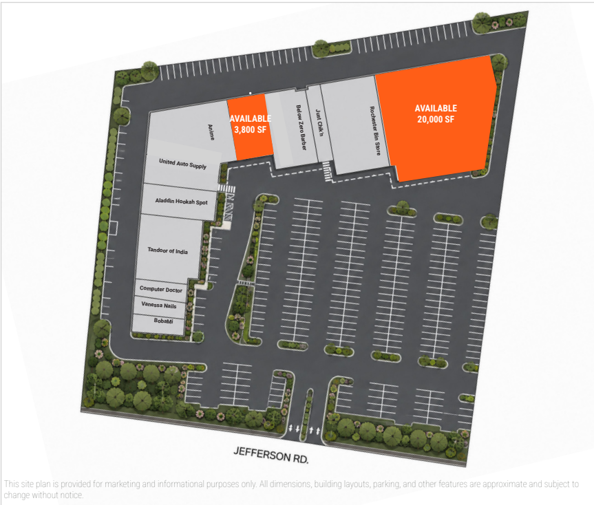
This site plan is provided for marketing and informational purposes only. All dimensions, building layouts, parking, and other features are approximate and subject to change without notice.