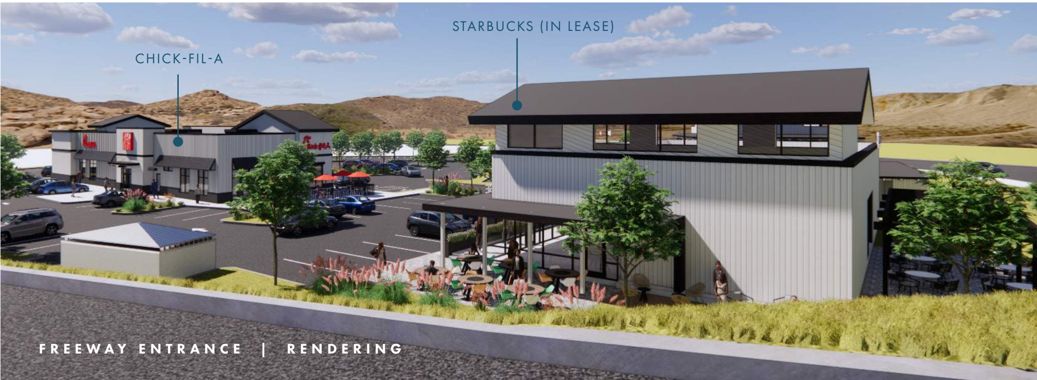
FREWAY ENTRANCE | RENDERING