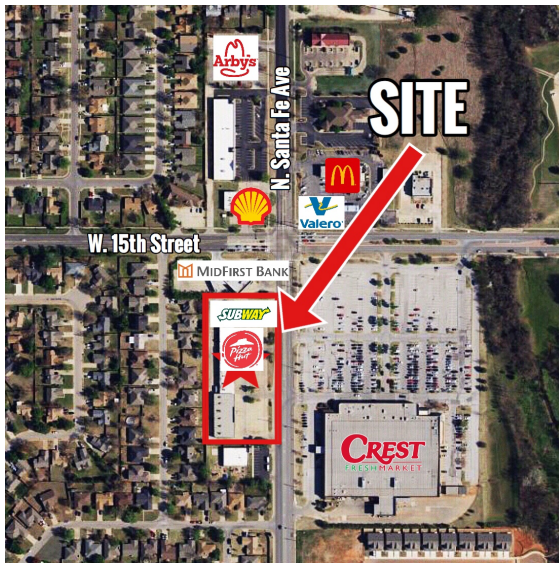
Map View 2019