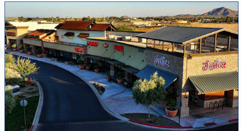
QUEEN CREEK MARKETPLACE