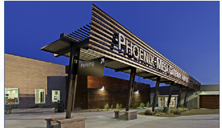
PHOENIX-MESA GATEWAY AIRPORT

Queen Creek, in the southeast corner of Maricopa County, Arizona is within 10 minutes of Phoenix-Mesa Gateway Airport and 45 minutes of Sky Harbor International Airport. This small town is an oasis in the East Valley of the Phoenix metropolitan area.