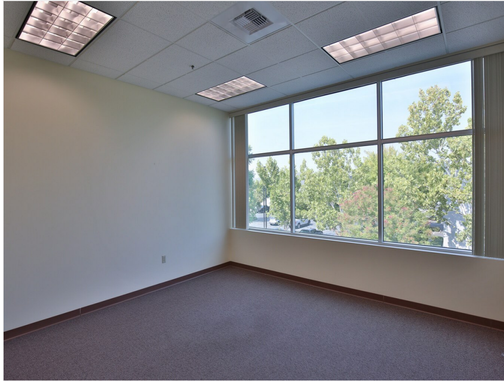
Office Interior Overview