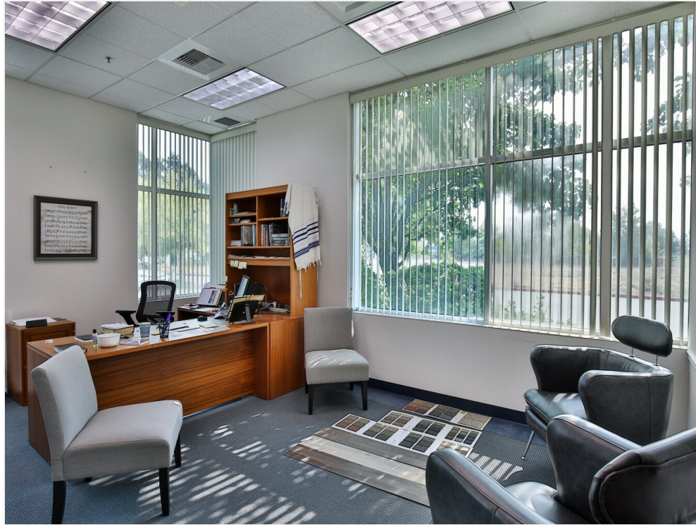
Private Office Space