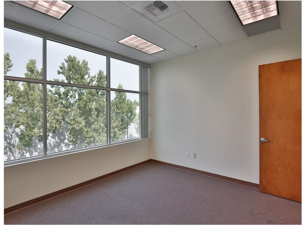
Office Interior Overview