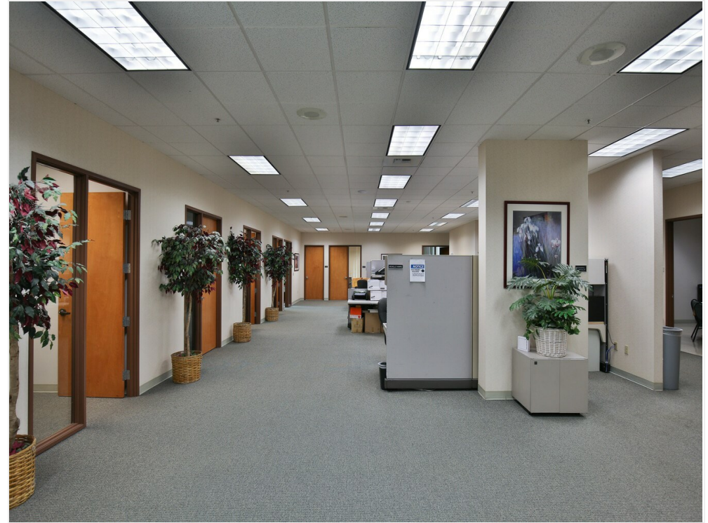
Office Interior Overview