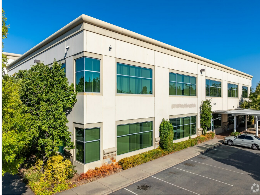
Alternate Building View