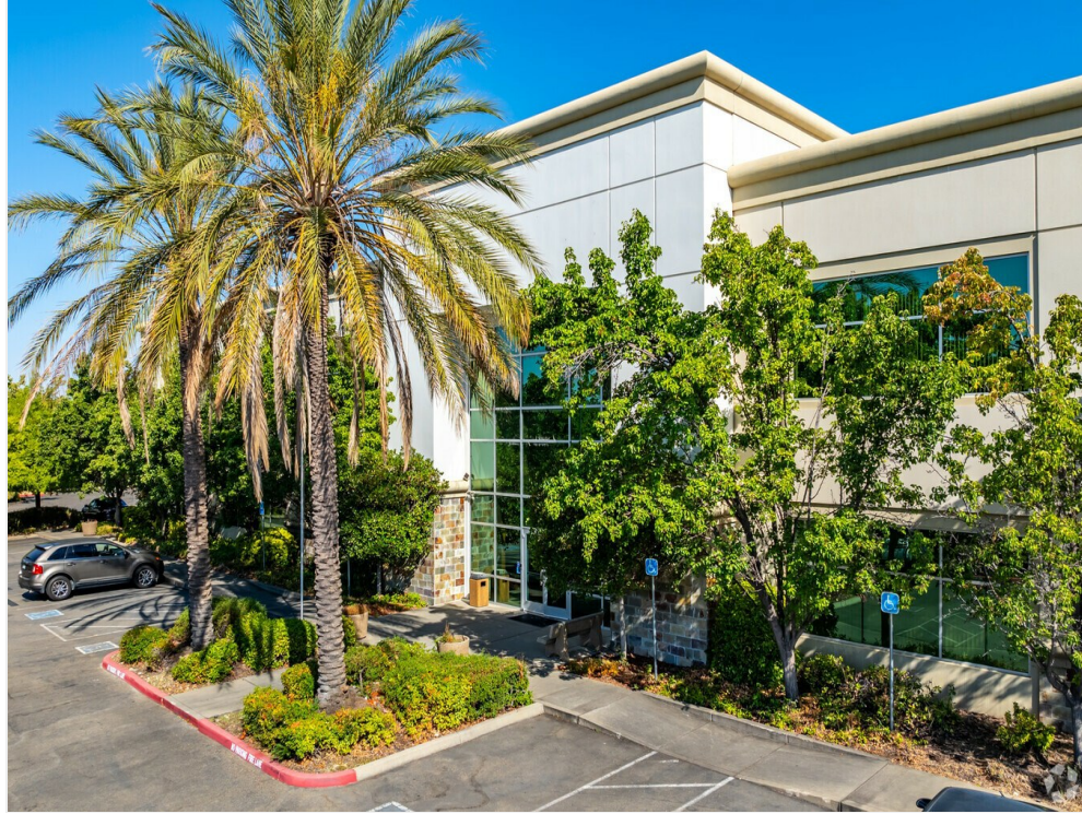
2440 Gold River Rd