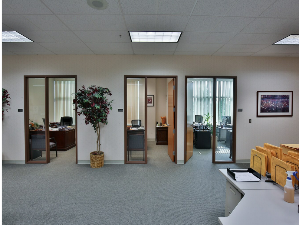
Office Interior Overview