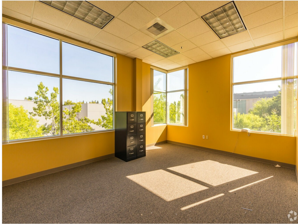
Office Interior Overview