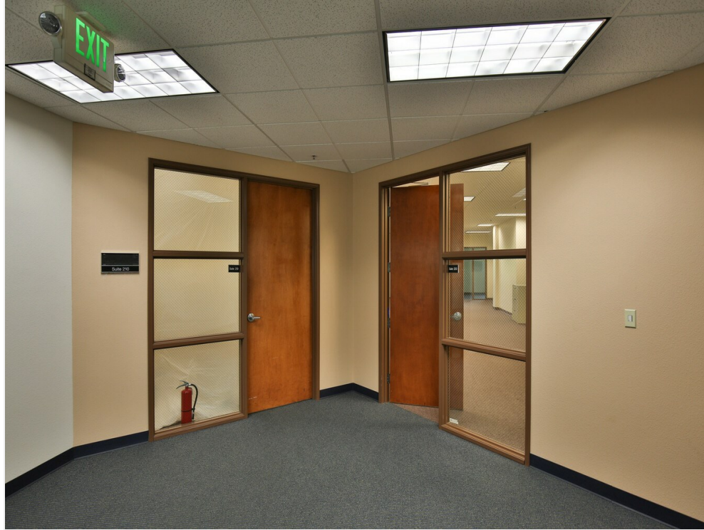
Office Interior Overview