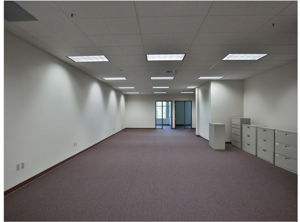
Office Interior Overview