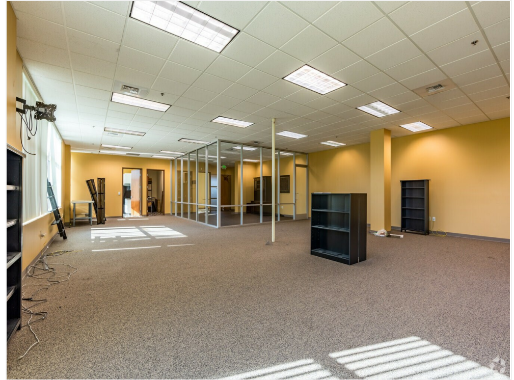
Office Interior Overview