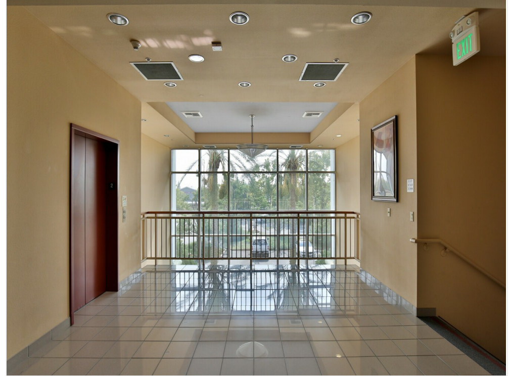
Second-Floor with Natural Light