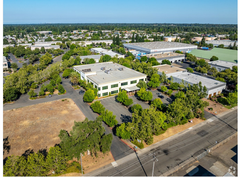
Aerial Overview of Gold River Business Park, Rancho Cordova, CA