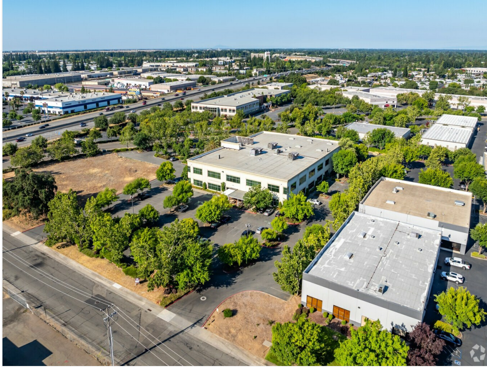
Aerial Overview of Gold River Business Park, Rancho Cordova, CA