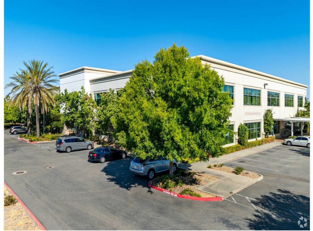
Overview of the Gold River Business Park