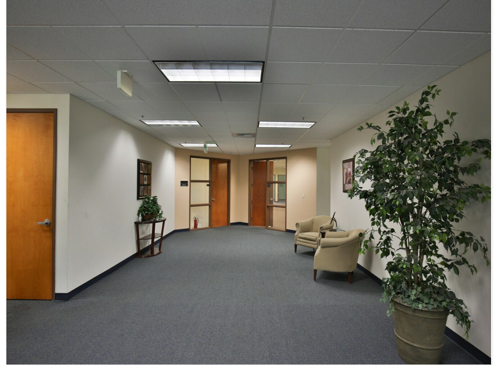
Office Interior Overview