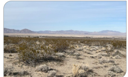
North View from South Property Line