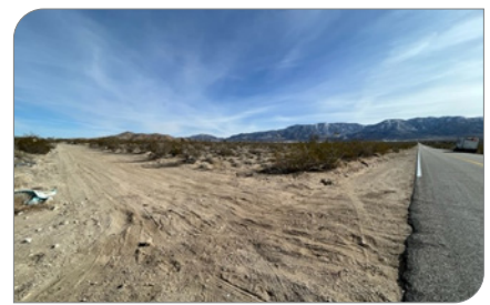
N.W. Site Corner with S.E. View

Lee & Associates Commercial Real Estate Services - Orange, Inc. DRE# 01011260 714-647-9100 LEEORANGE.COM