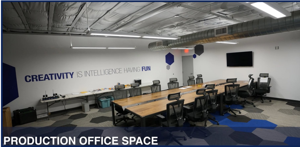
PRODUCTION OFFICE SPACE