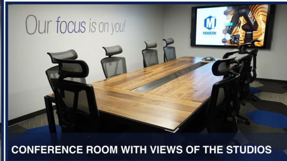
CONFERENCE ROOM WITH VIEWS OF THE STUDIOS