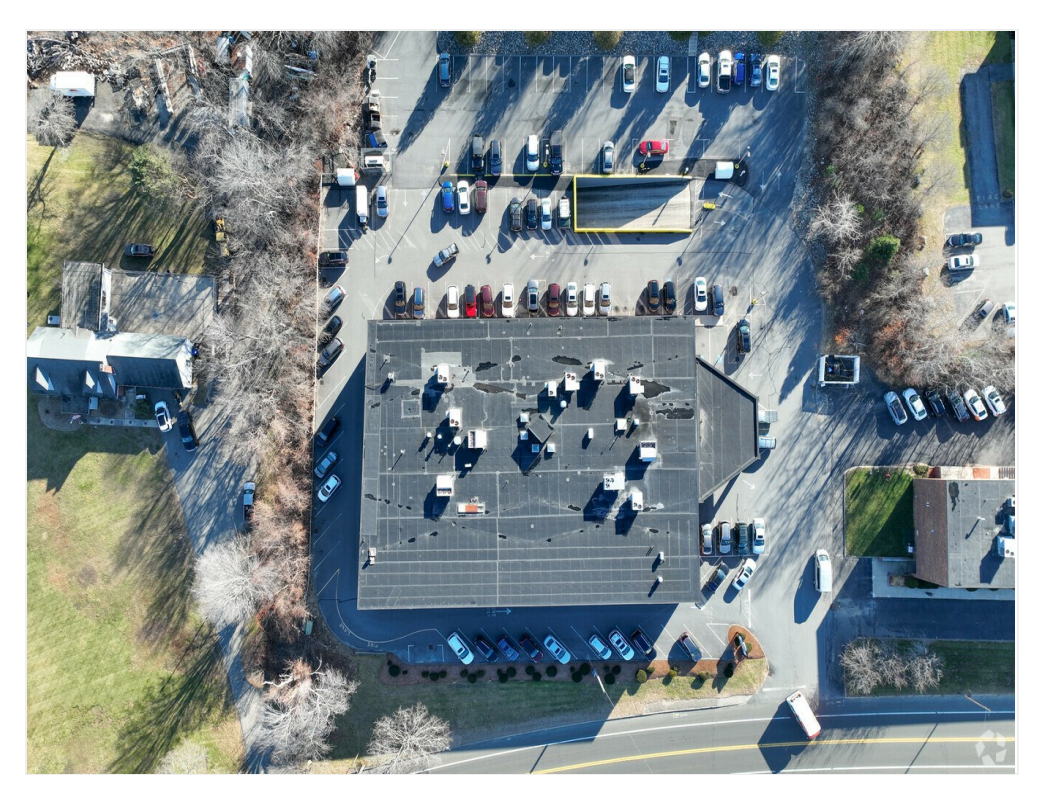
90 Degree Aerial Photo