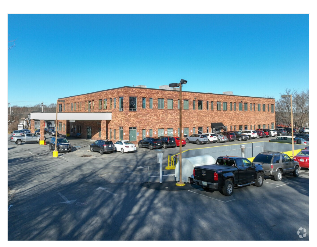
Plenty of Surface Parking Available