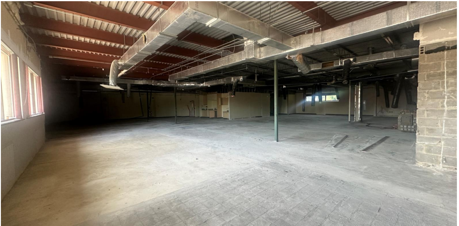
Space Gutted – Ready for Buildout