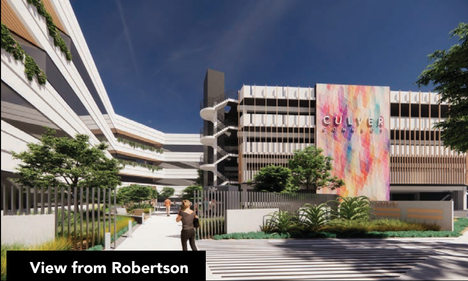
View from Robertson