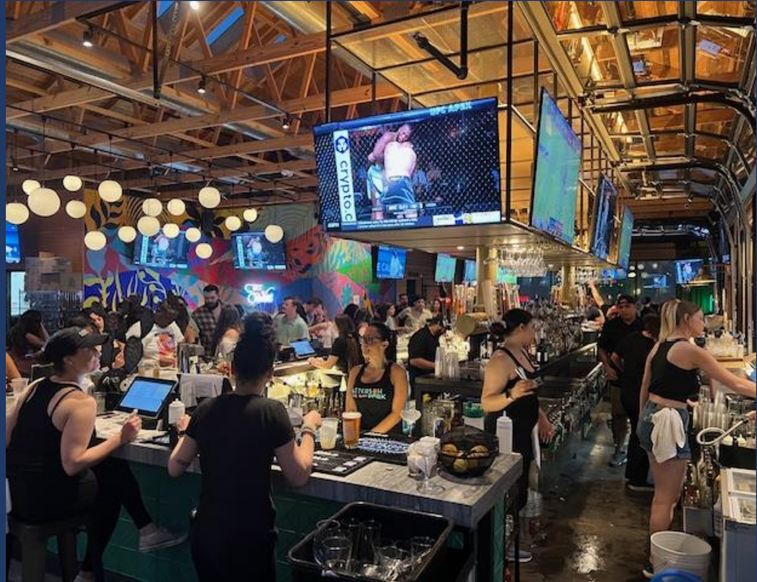
Main Interior Bar –serving inside and outside via garage doors