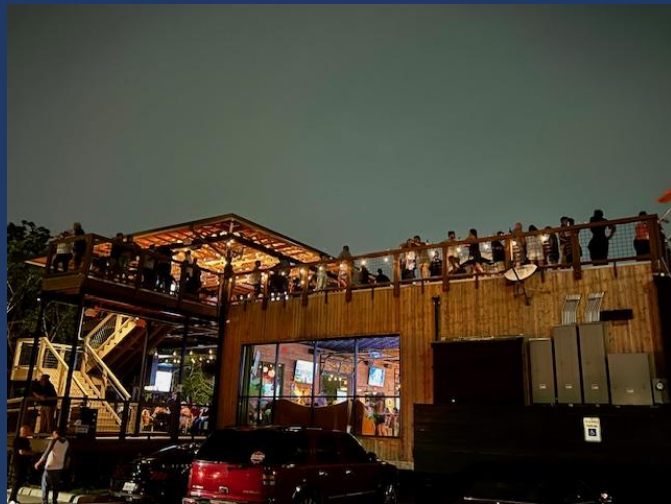
2 nd Level Deck