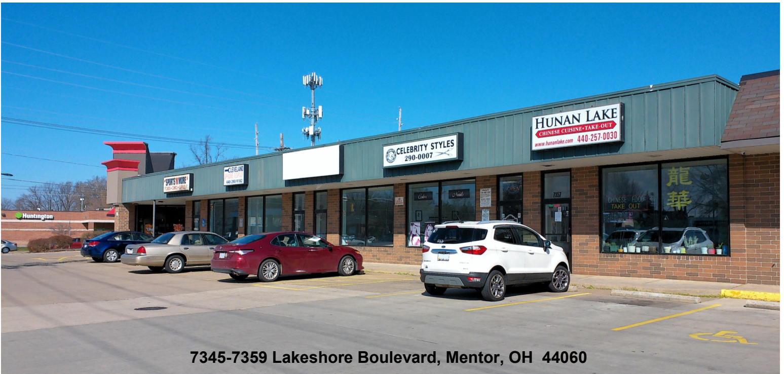
7345-7359 Lakeshore Boulevard, Mentor, OH 44060