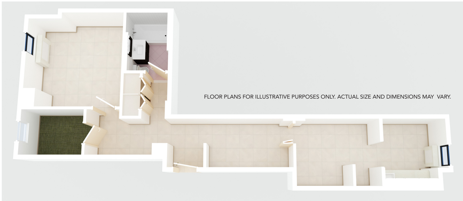
FLOOR PLANS FOR ILLUSTRATIVE PURPOSES ONLY. ACTUAL SIZE AND DIMENSIONS MAY VARY.

P: 212.893.1450 E: alisia.ramlochan@corcoran.com