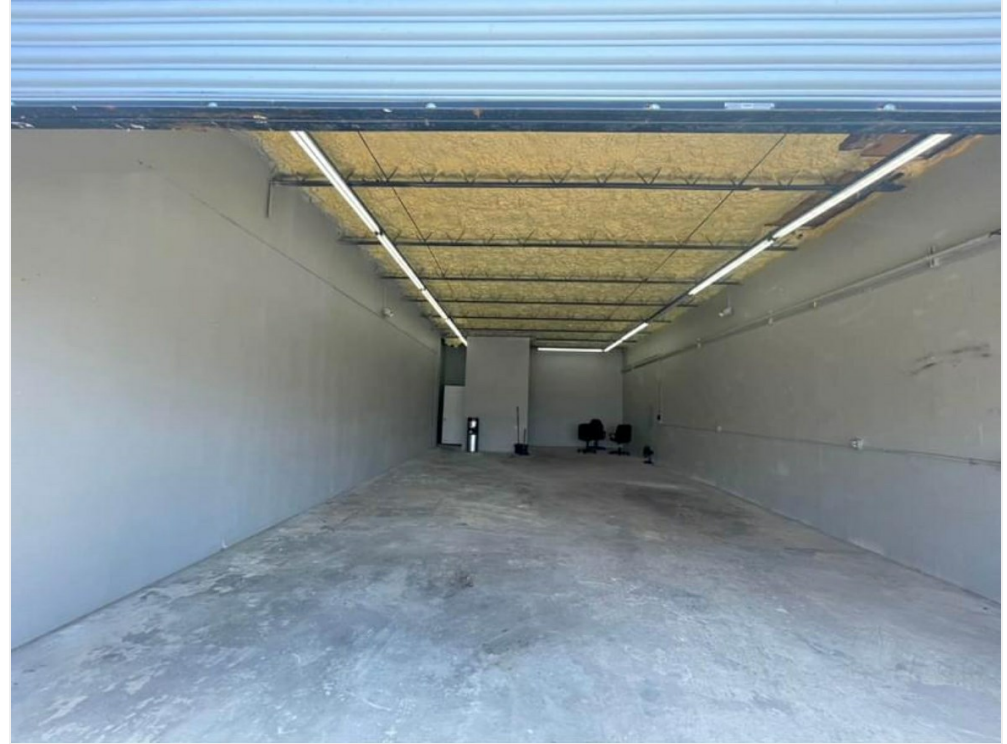
Cape PKWY 6