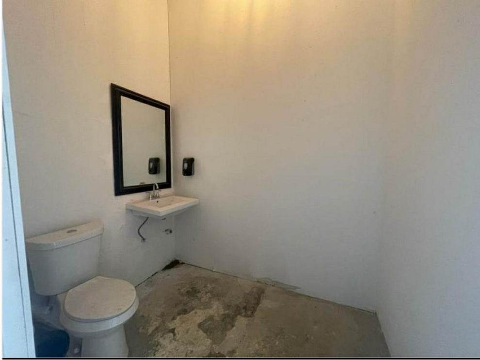
Cape PKWY 2