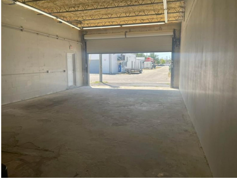
Cape PKWY 5