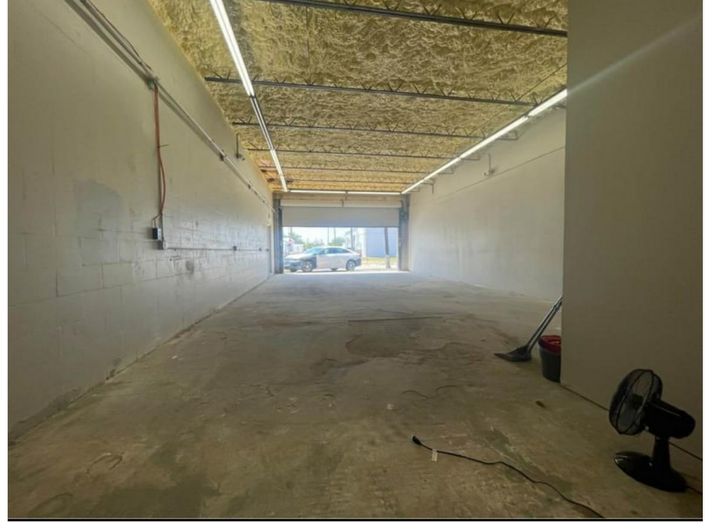
Cape PKWY 3