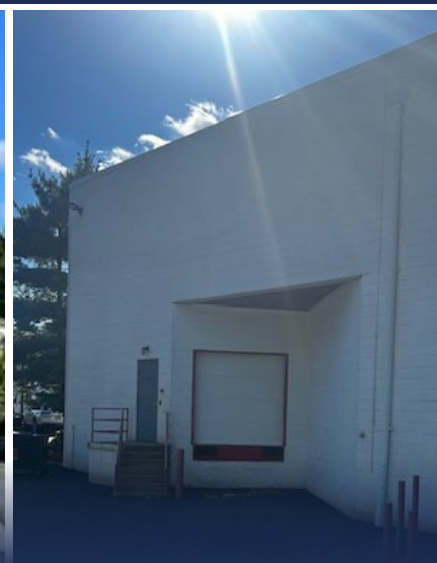
11 COMMERCE WAY | 5,407 SF 1 TAILBOARD – 12/1/2024 OCCUPANCY