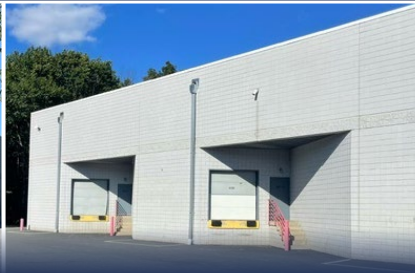
60 COMMERCE WAY | 13,823 SF 2 TAILBOARDS – IMMEDIATE OCCUPANCY