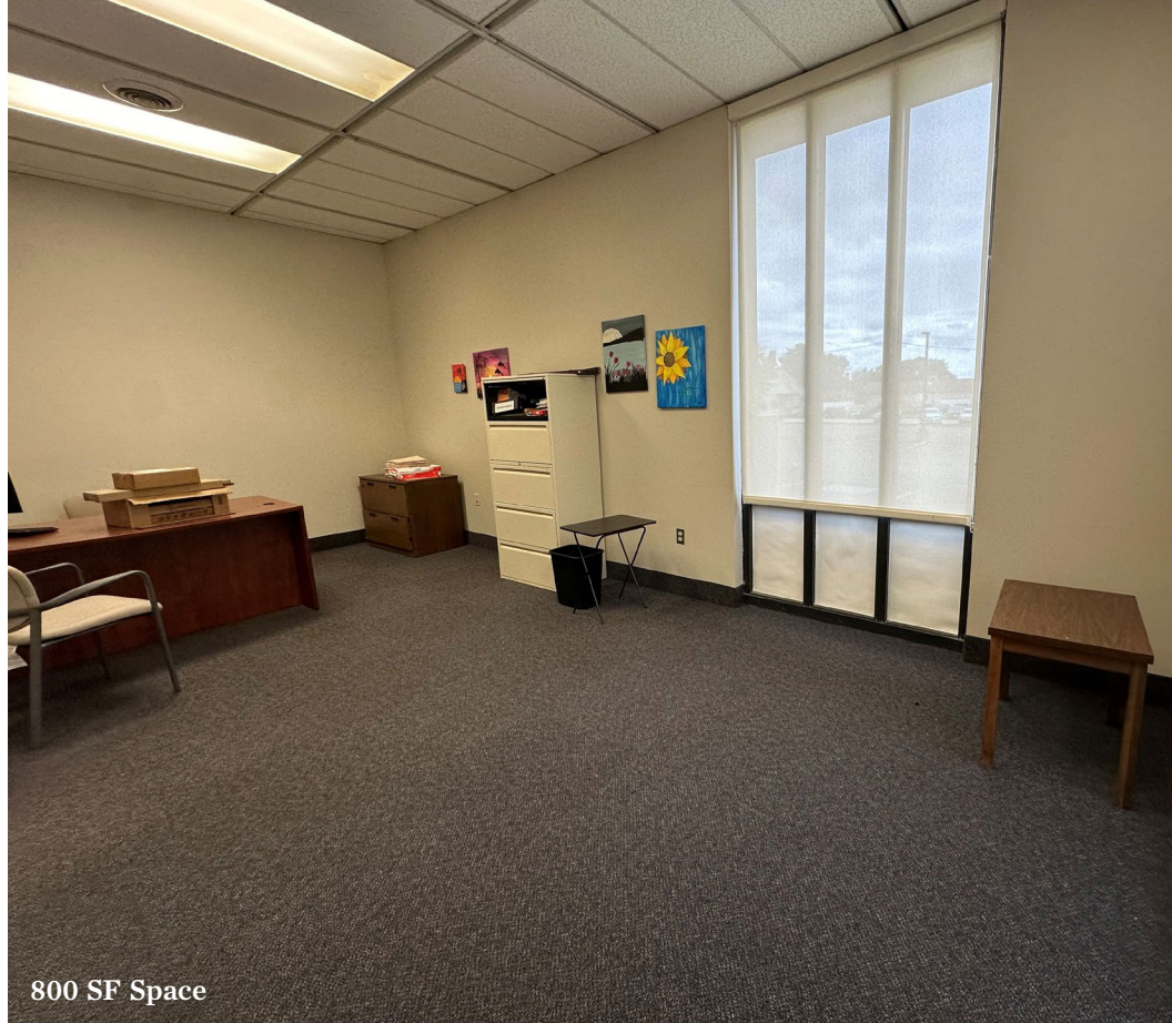
800 SF Space