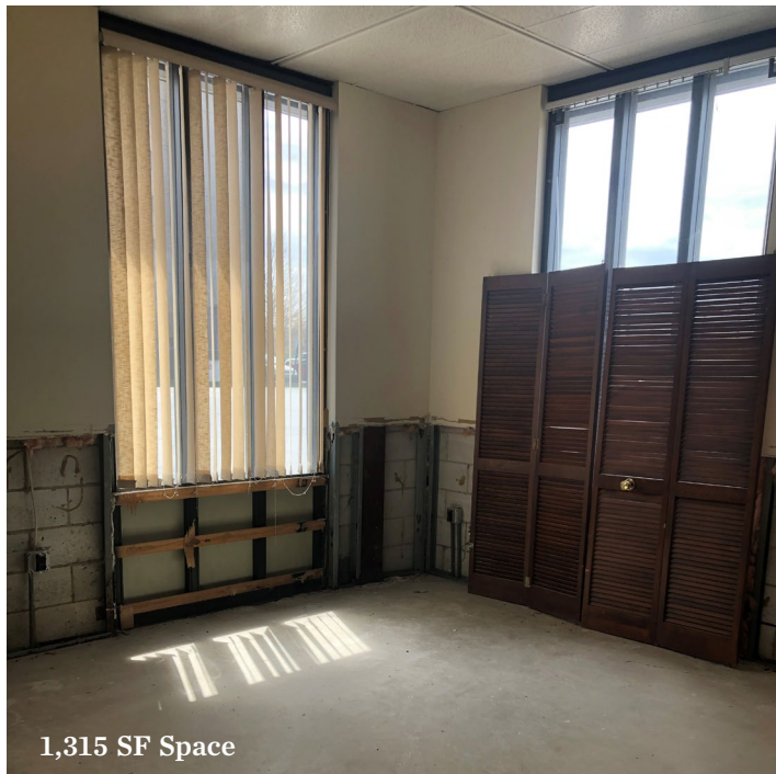
1,315 SF Space