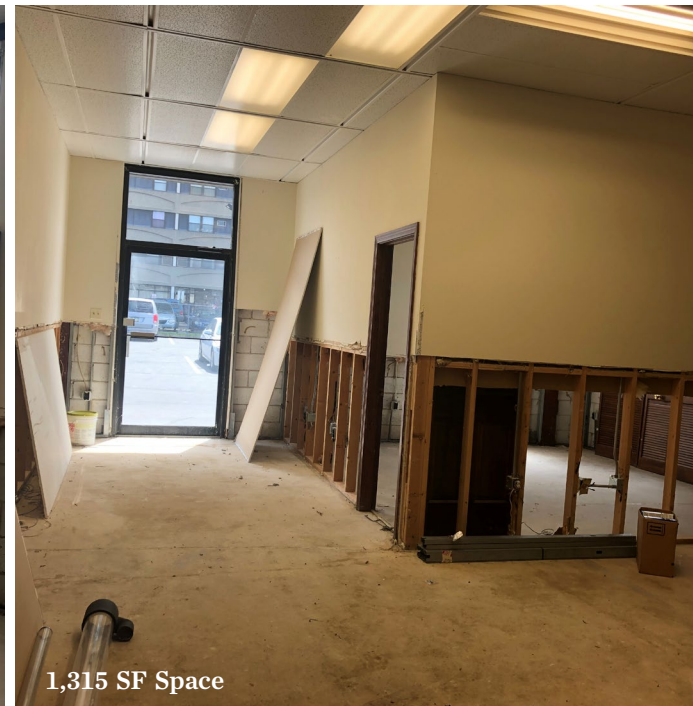
1,315 SF Space