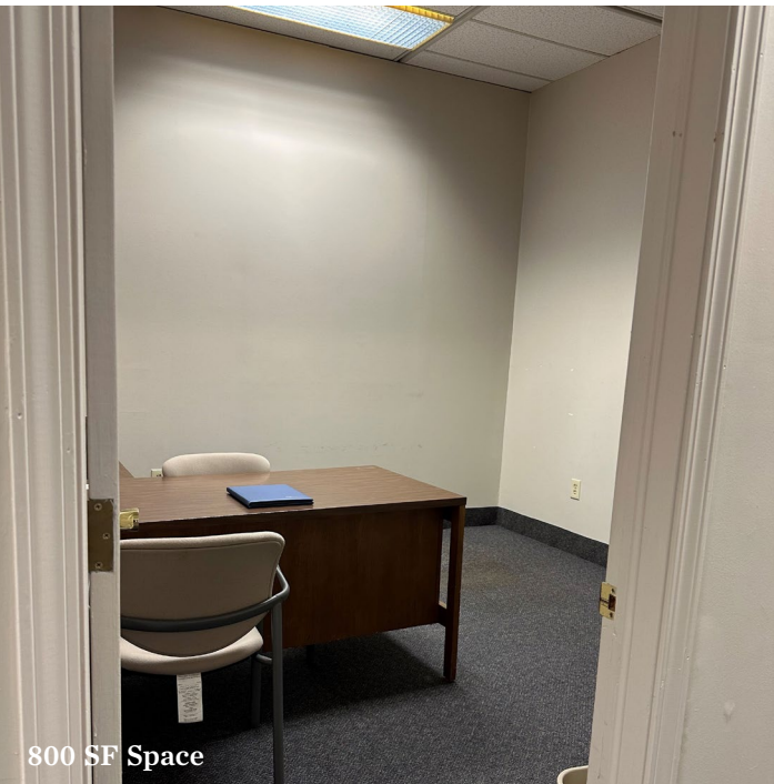
800 SF Space