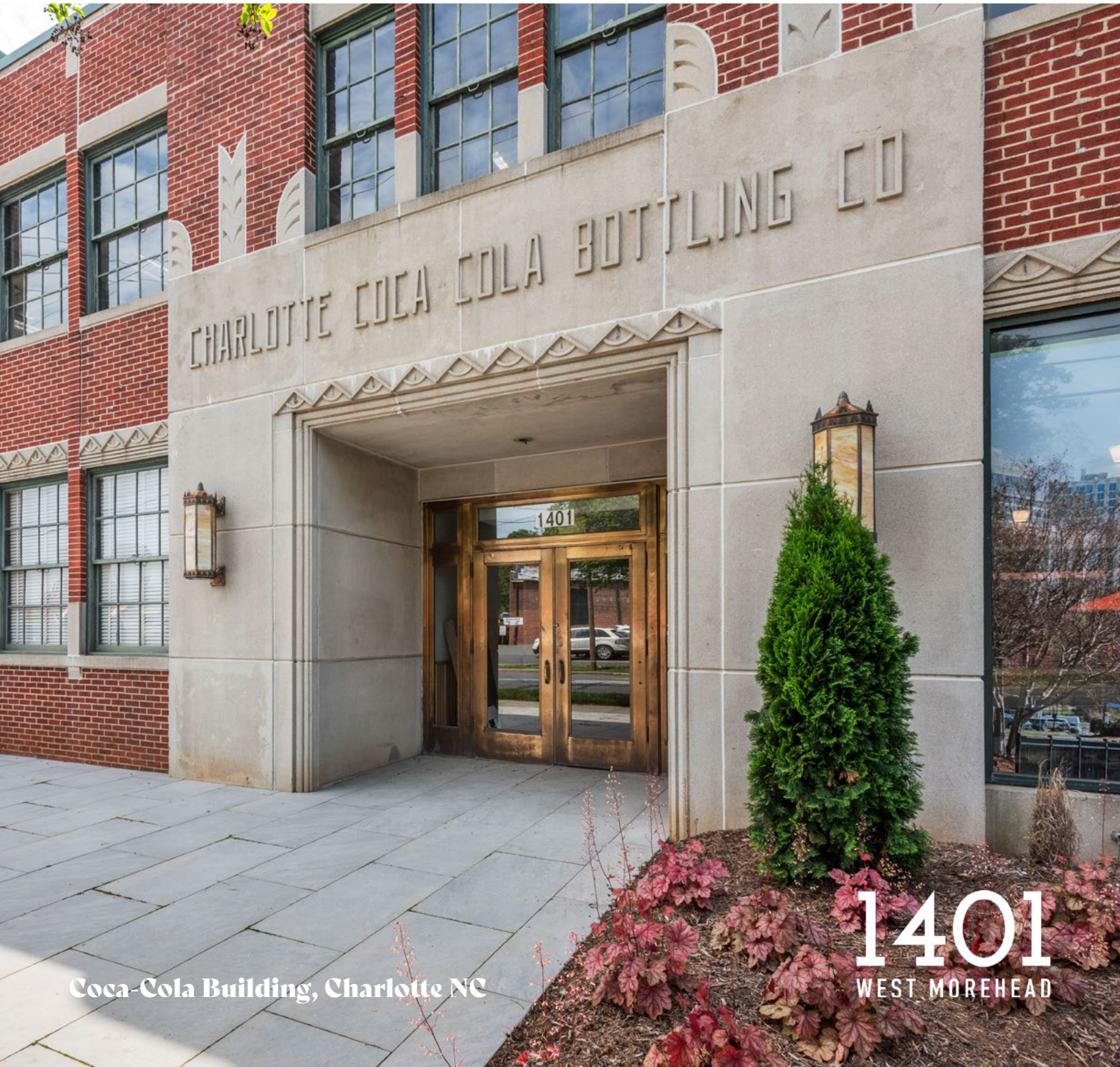
Coca-Cola Building, Charlotte NC