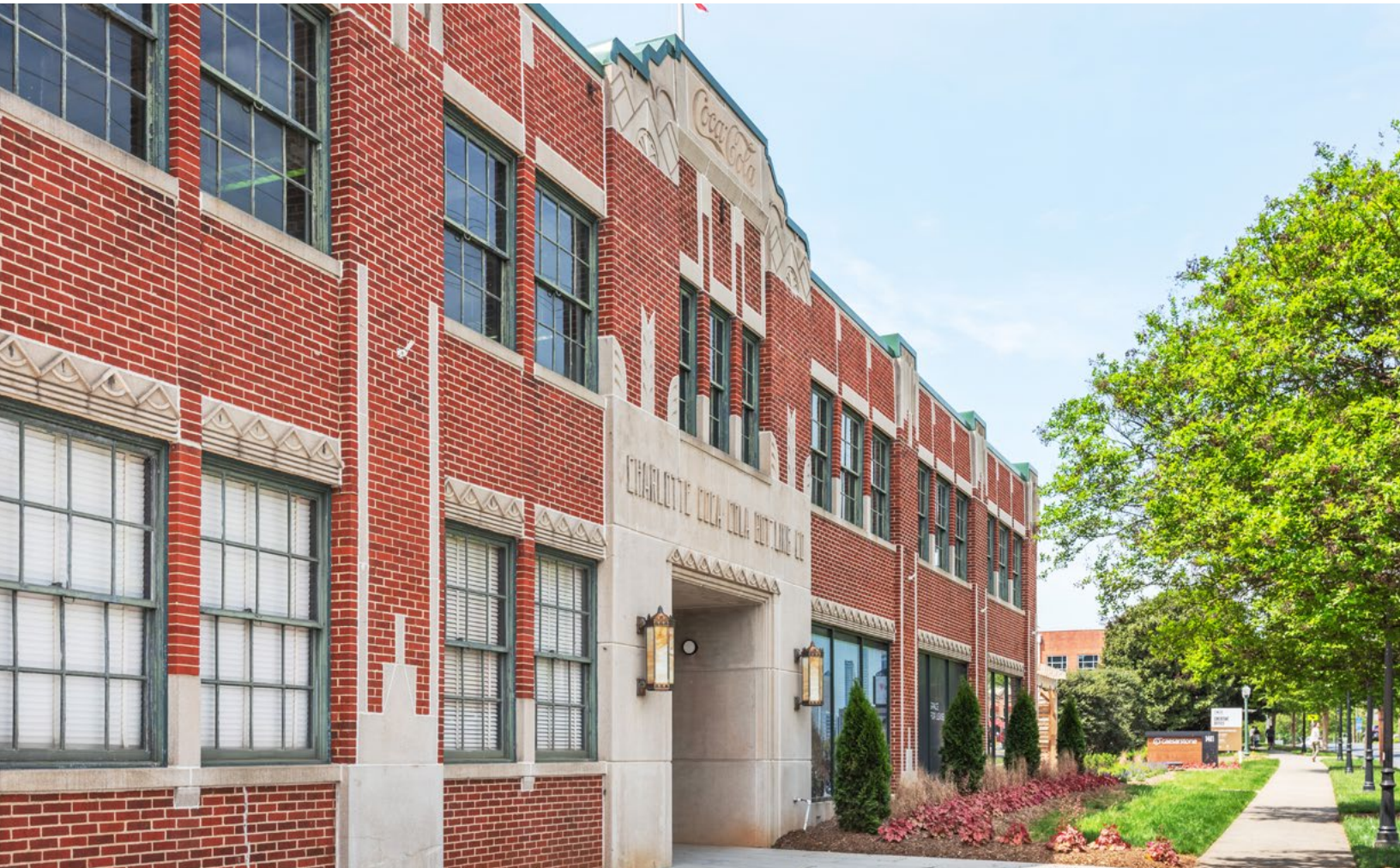
1401 WEST MOREHEAD SITE PLAN