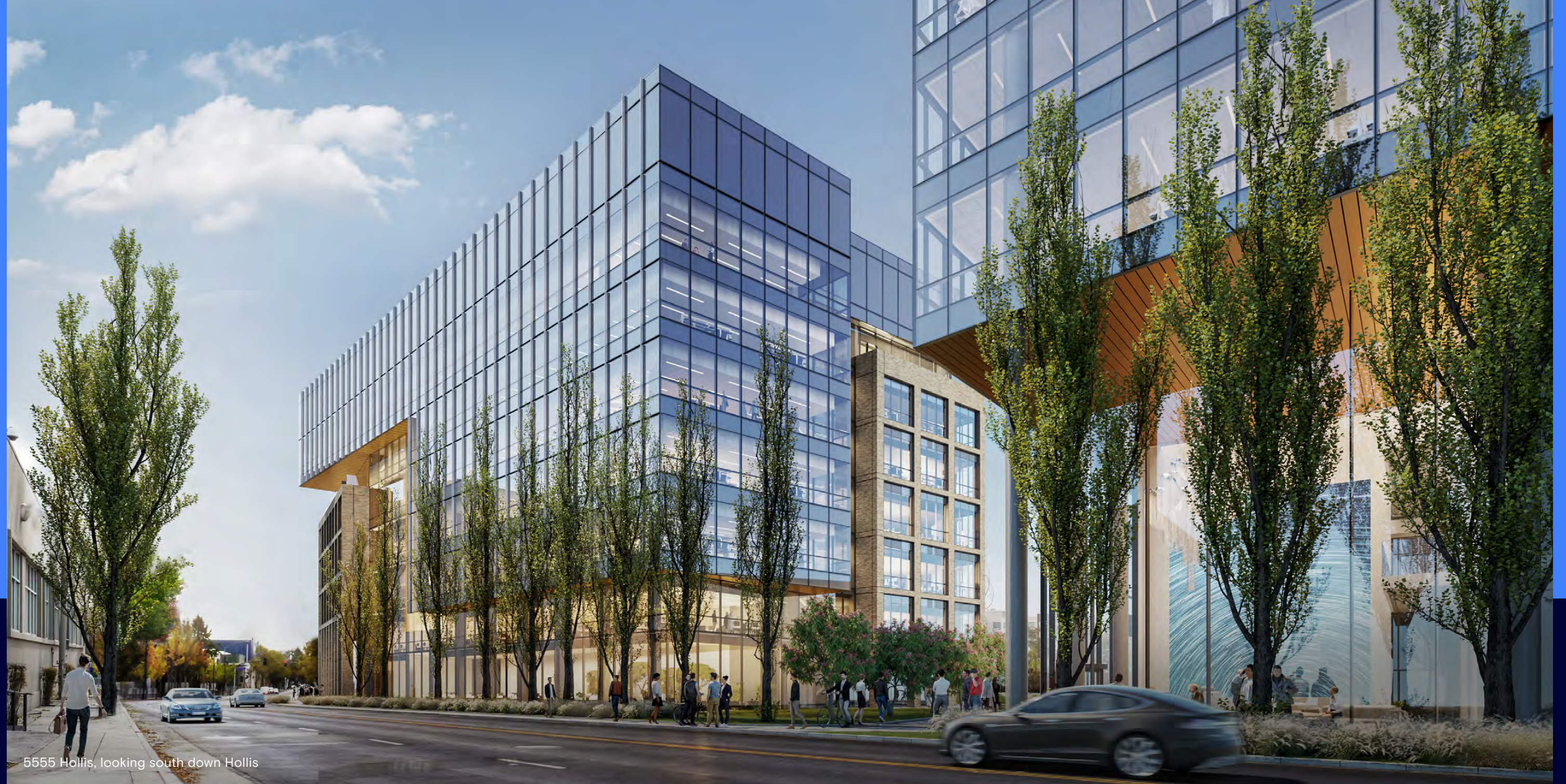
5555 Hollis, looking south down Hollis