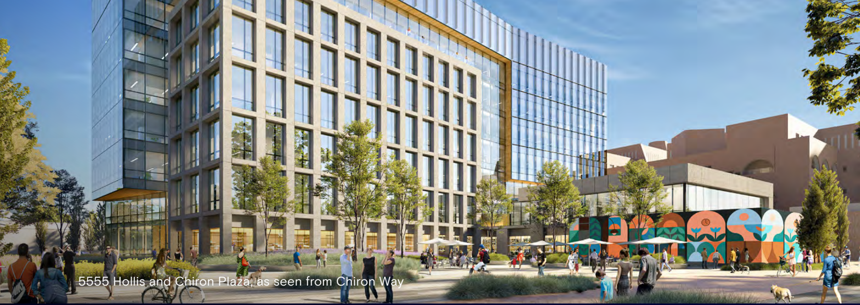
5555 Hollis and Chiron Plaza, as seen from Chiron Way