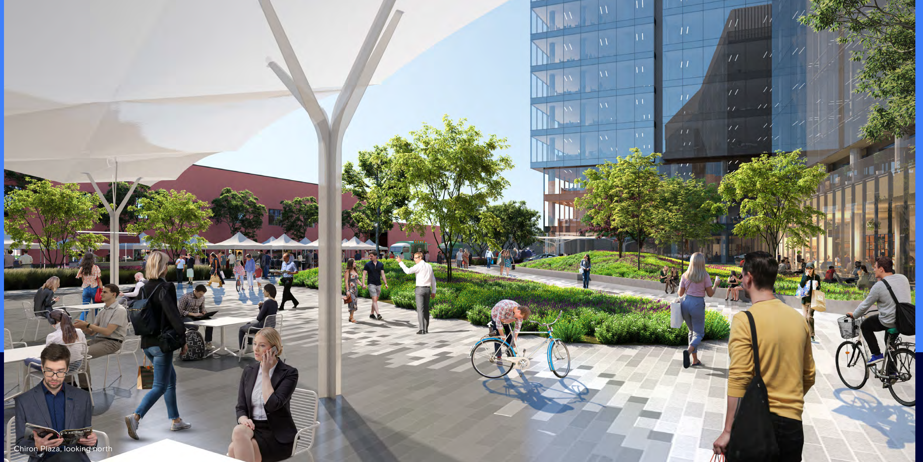
Chiron Plaza, looking north