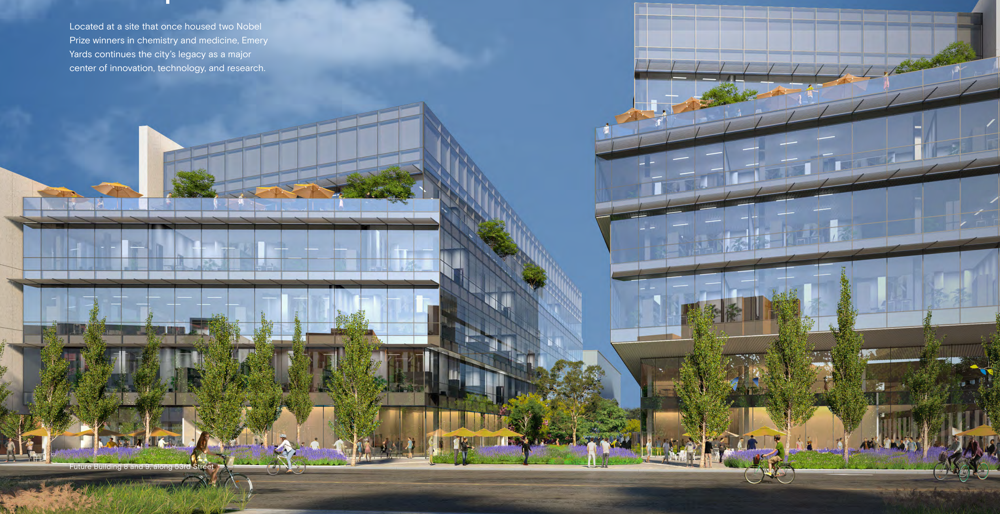
Future Building 8 and 9, along 53rd Street

Located at a site that once housed two Nobel Prize winners in chemistry and medicine, Emery Yards continues the city's legacy as a major center of innovation, technology, and research.