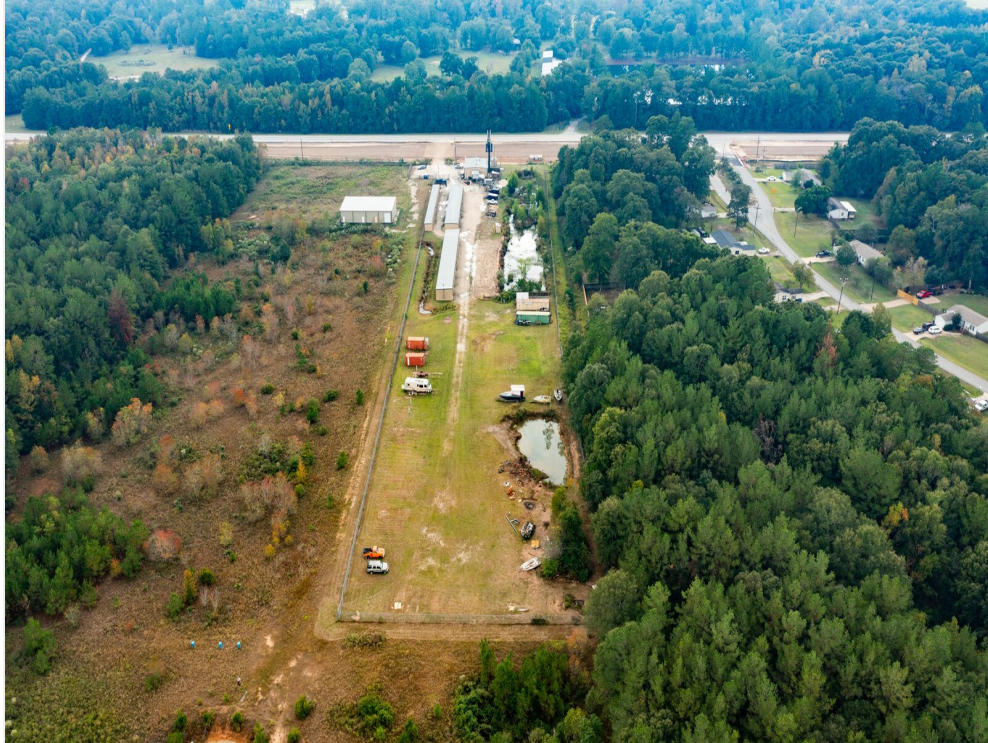
Arial - Facing toward Hwy 242