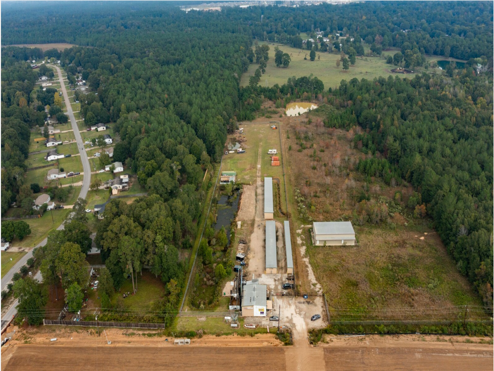
Arial from Hwy 242