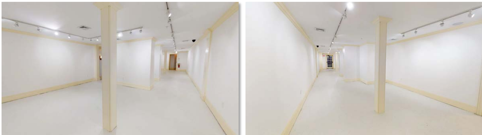
Lower Level Current Condition

Visit www.33ACK.com for more information and videos.