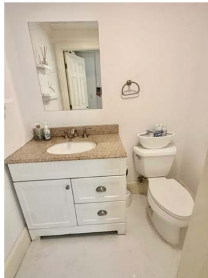
Lower-Level Retail Bathroom

For Additional Information Please Contact: