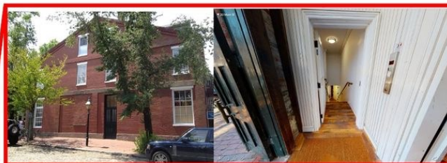
Second Entrance from Federal Street showing steps & elevator down to the Lower Level Retail.