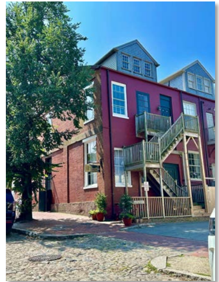
External View from Federal Street