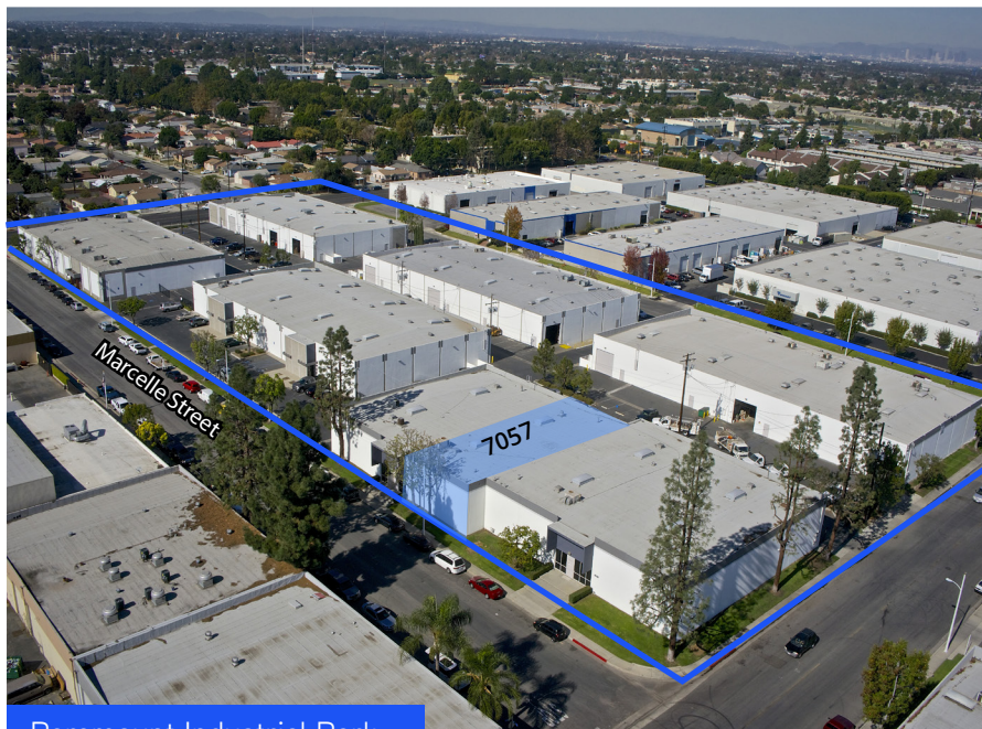
Paramount Industrial Park