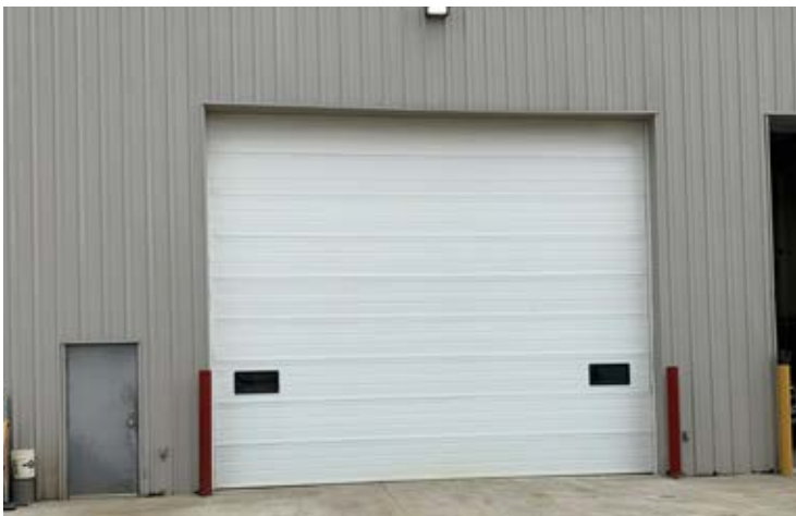
1 x 22' x 18' Oversized Grade Door