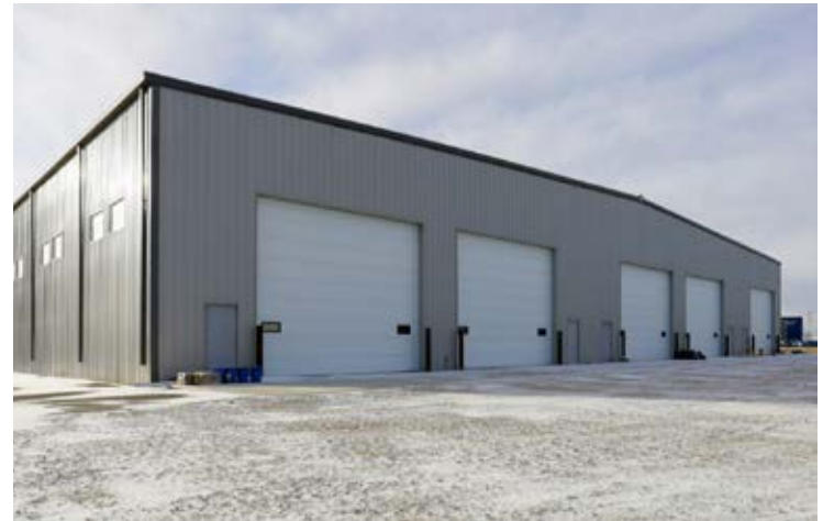
Fenced and Secured Yard