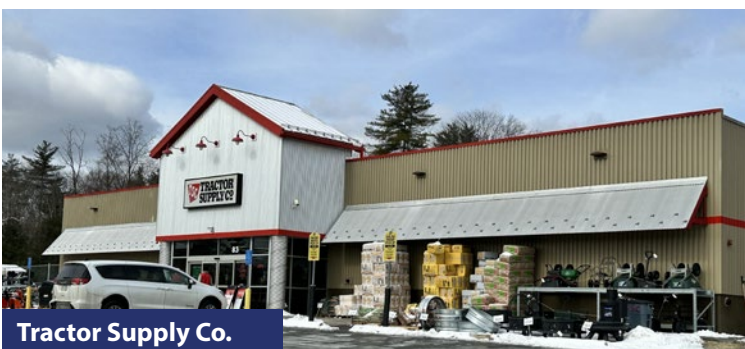
Tractor Supply Co.