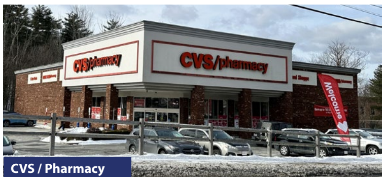
CVS / Pharmacy