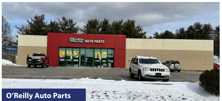
O'Reilly Auto Parts