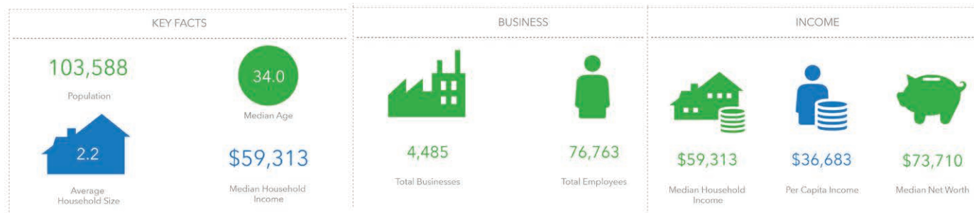
Households By Income

The largest group: $50,000 - $74,999 (18.8%) The smallest group: $150,000 - $199,999 (5.2%)