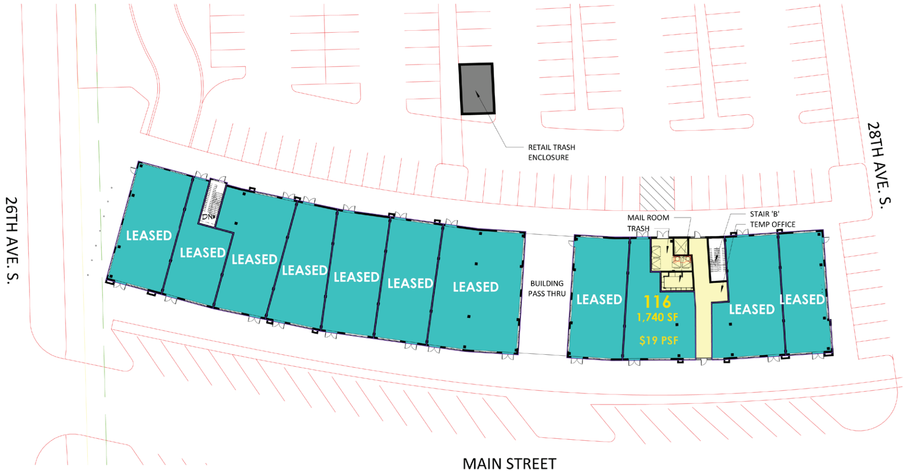
2 FIRST LEVEL FLOOR PLAN MP1.1 1" = 30'-0"