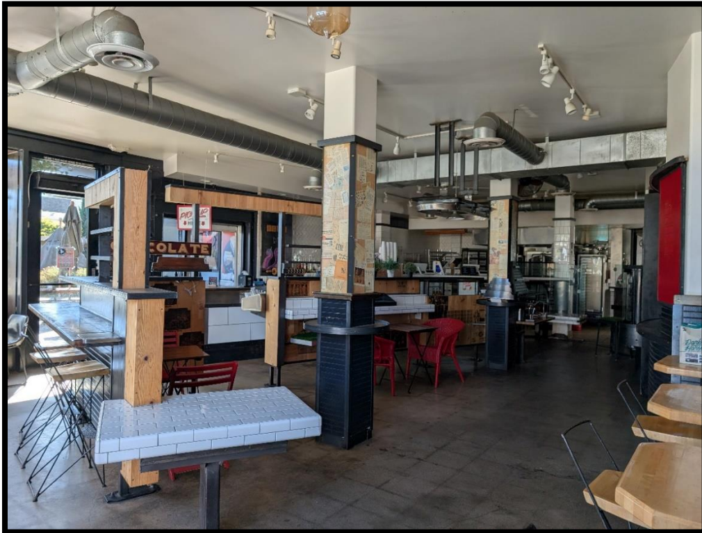
BAKERY VIEW FROM FRONT ENTRY DOOR