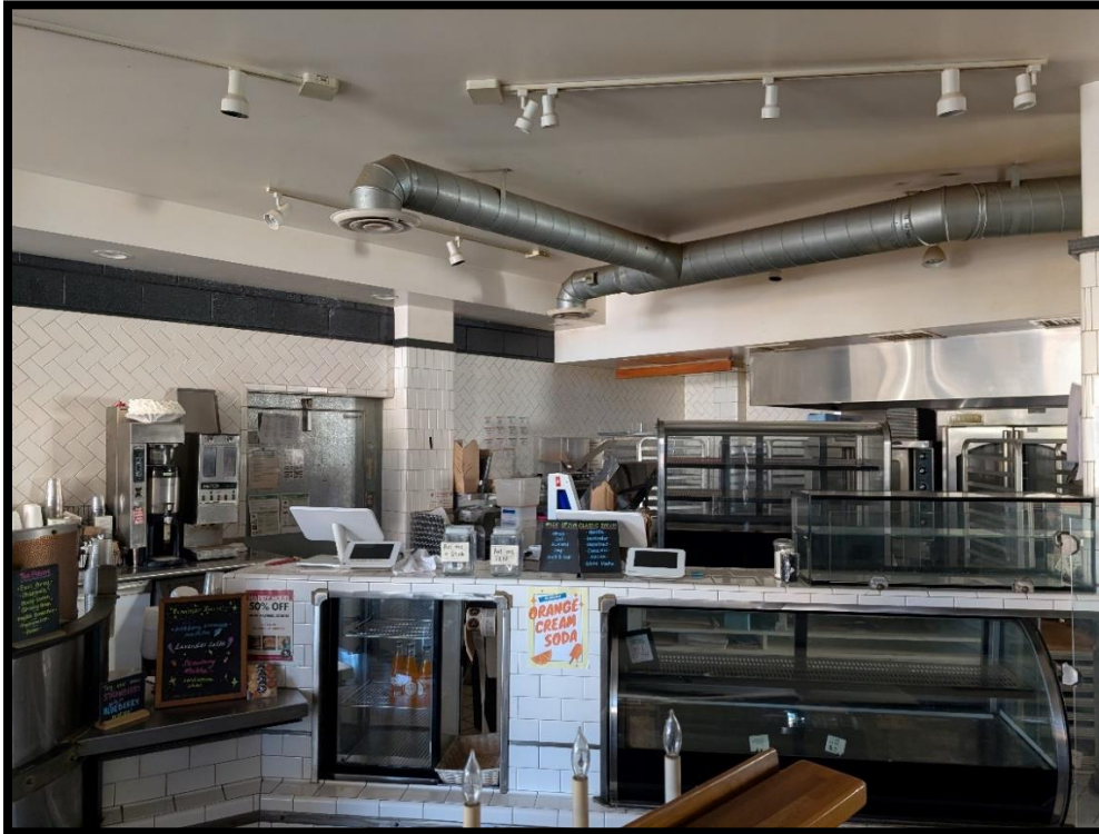
BAKERY FRONT COUNTER