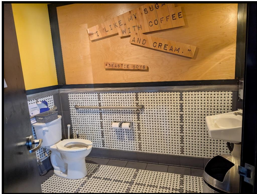
UNISEX BATHROOM #2