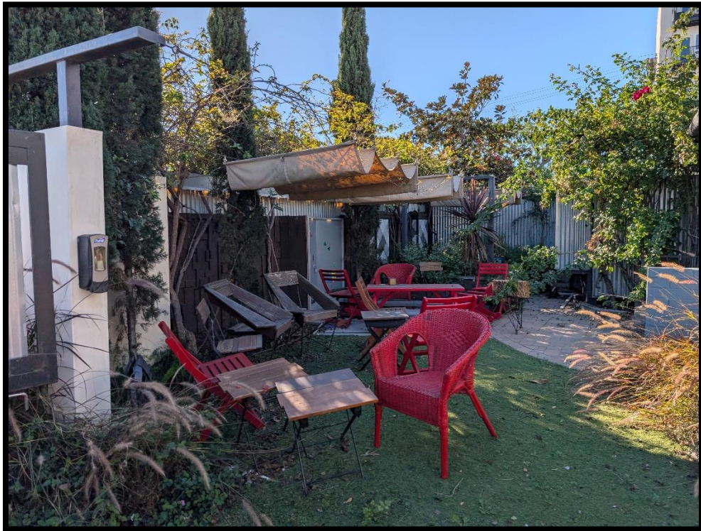
PATIO WEST NOOK