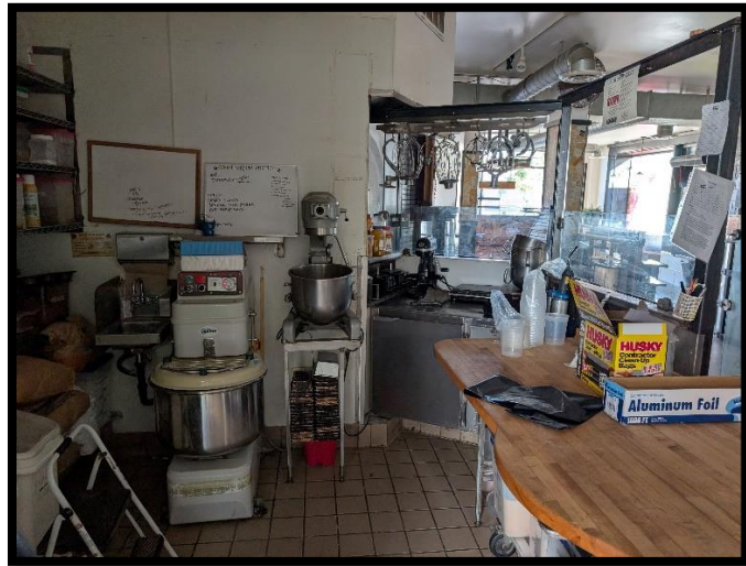
BAKERY PREP AREA