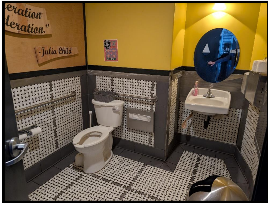
UNISEX BATHROOM #1