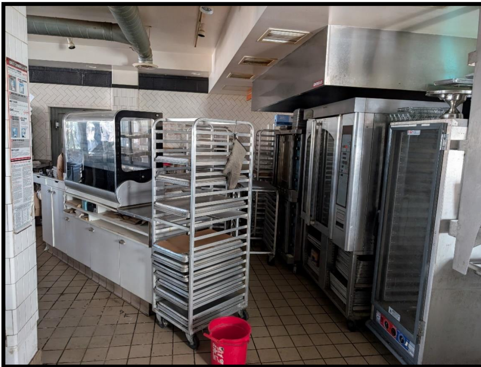
BAKERY OVENS, RACKS, PROOFER, VENT HOOD