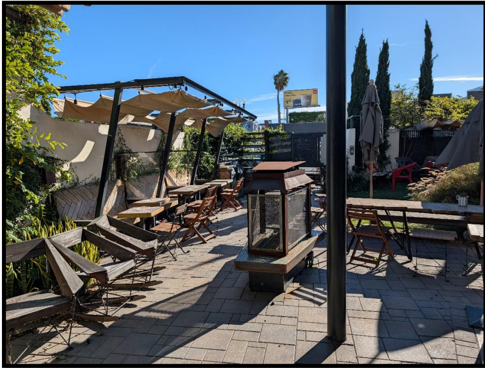
PATIO VIEW FROM BAKERY