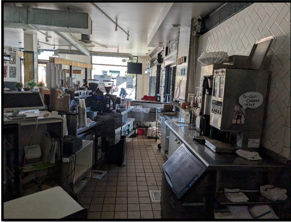
BACK OF COUNTER PREP AREA