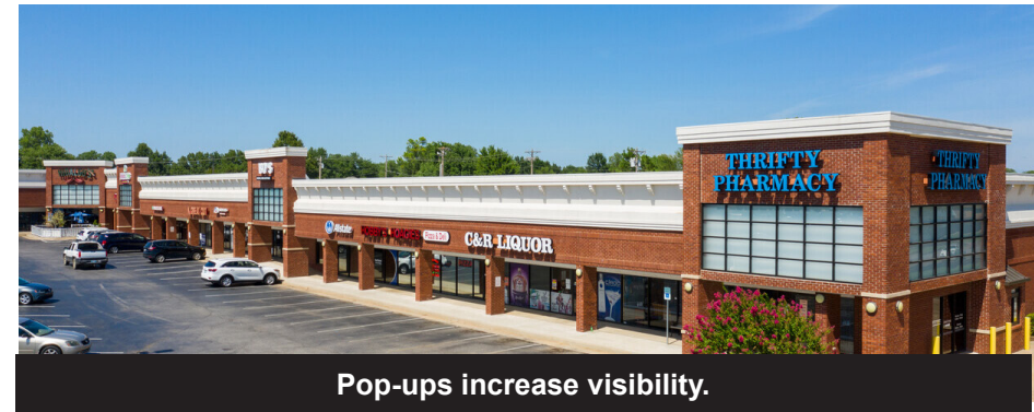
Pop-ups increase visibility.