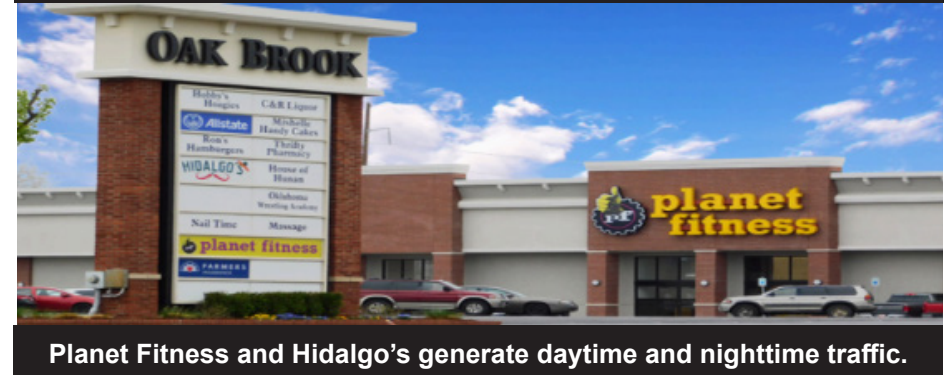
Planet Fitness and Hidalgo's generate daytime and nighttime traffic.