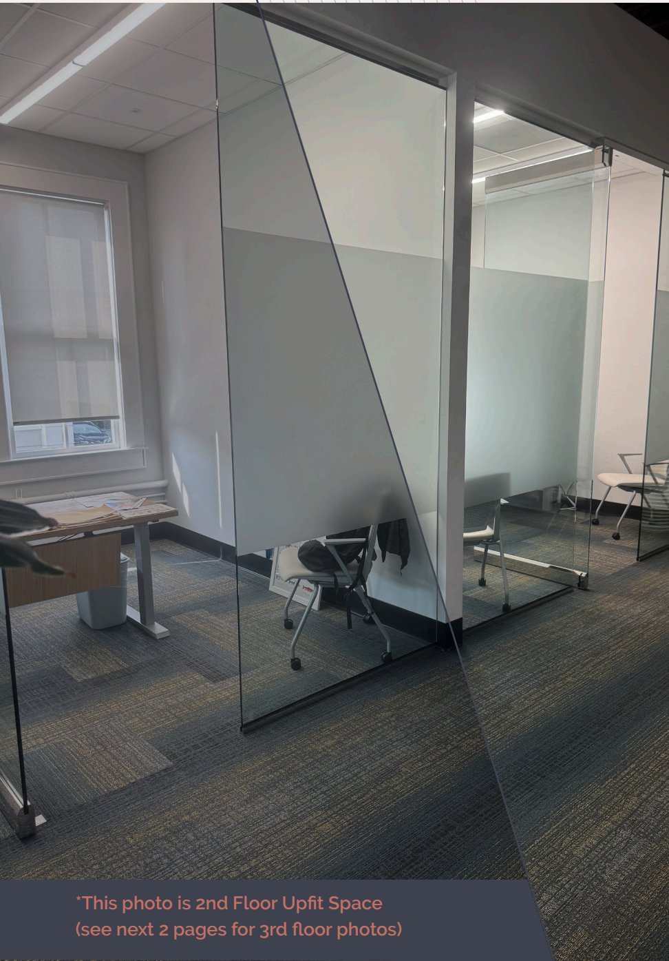
*This photo is 2nd Floor Upfit Space (see next 2 pages for 3rd floor photos)