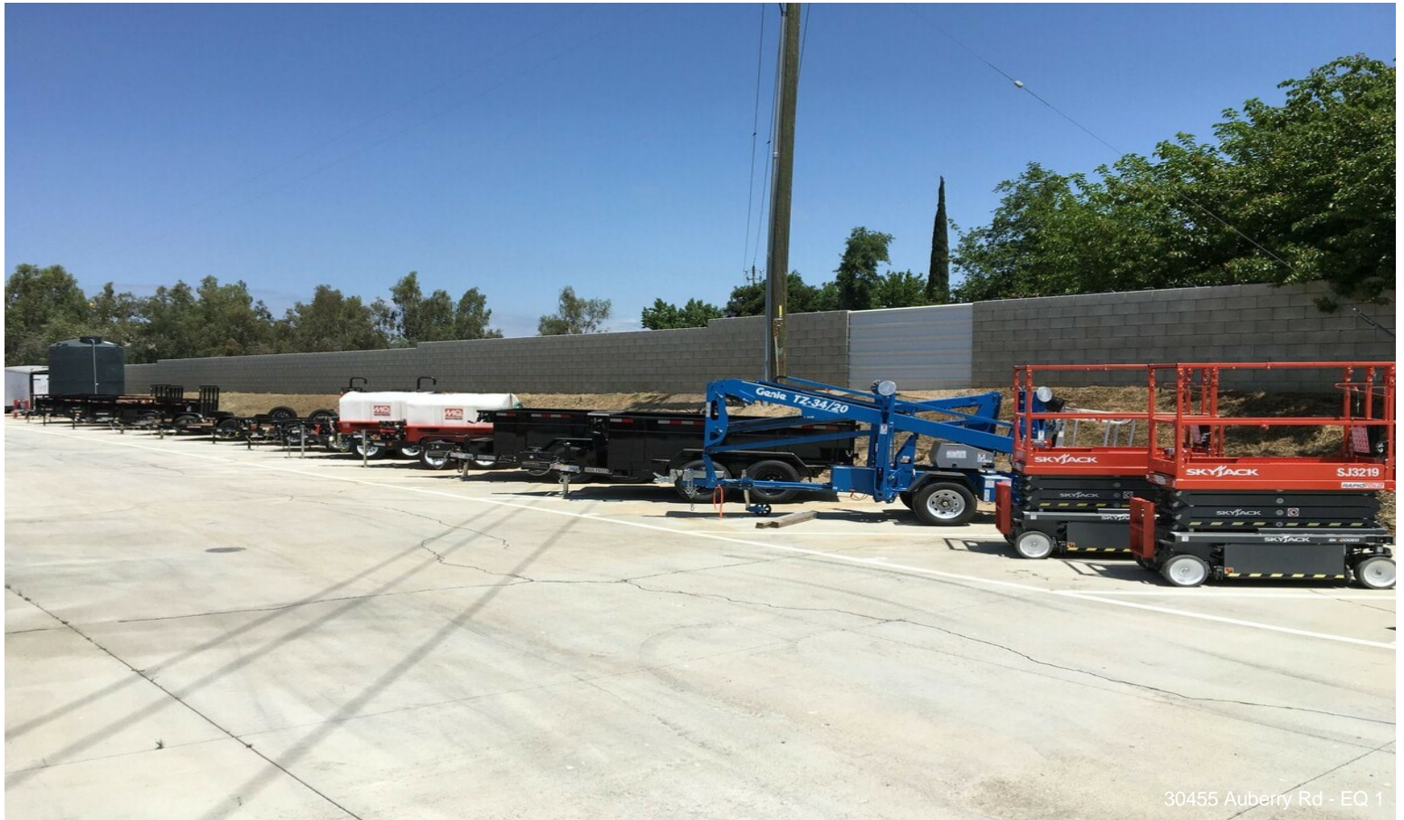
30455 Auberry Rd - EQ 1