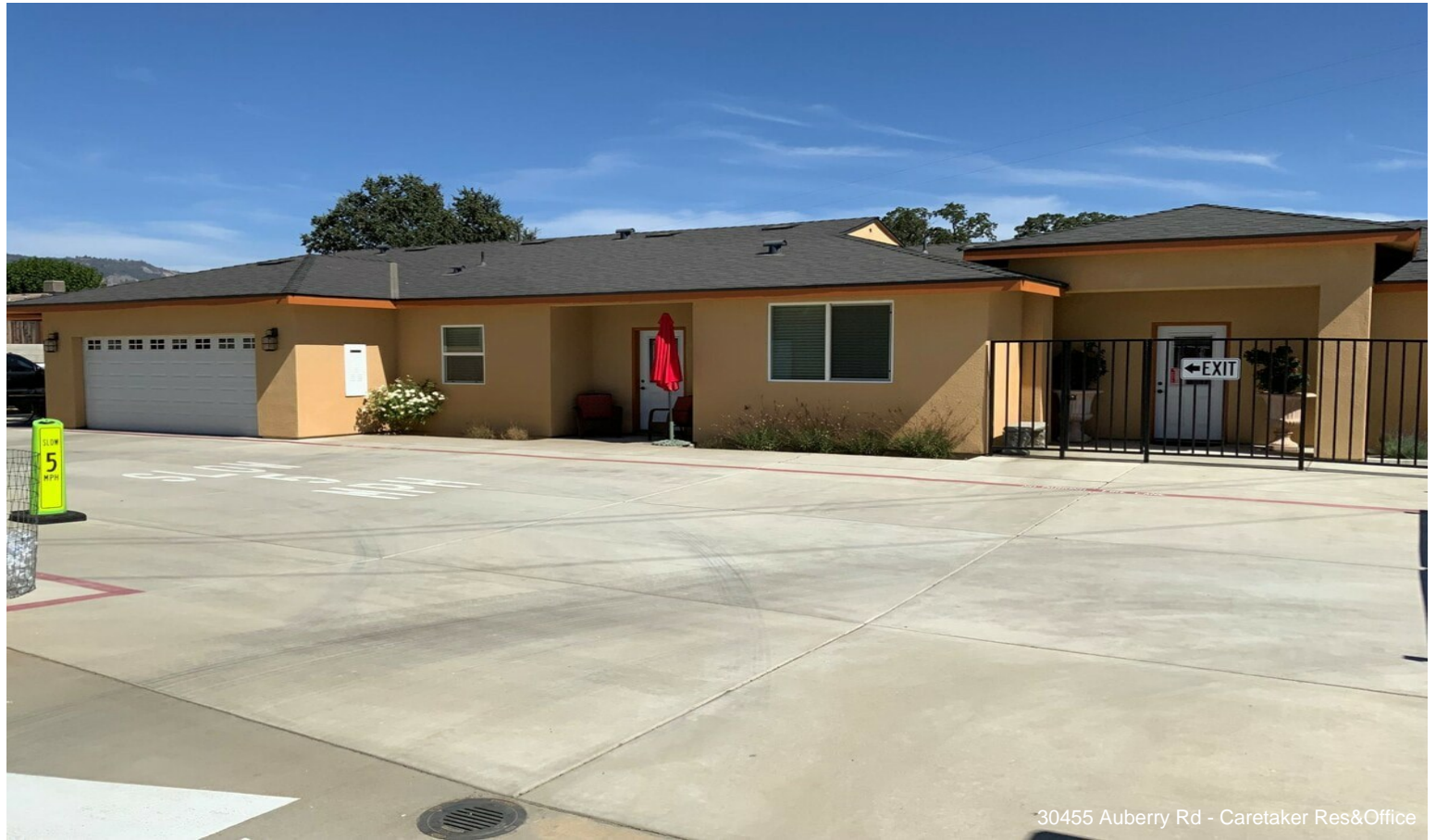
30455 Auberry Rd - Caretaker Res&Office