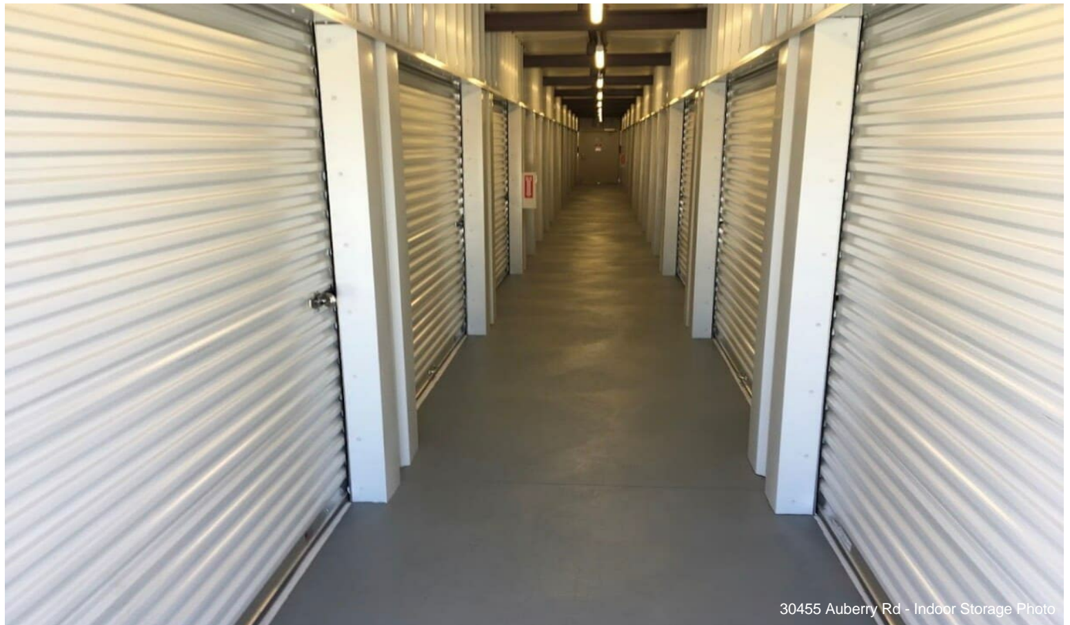
30455 Auberry Rd - Indoor Storage Photo