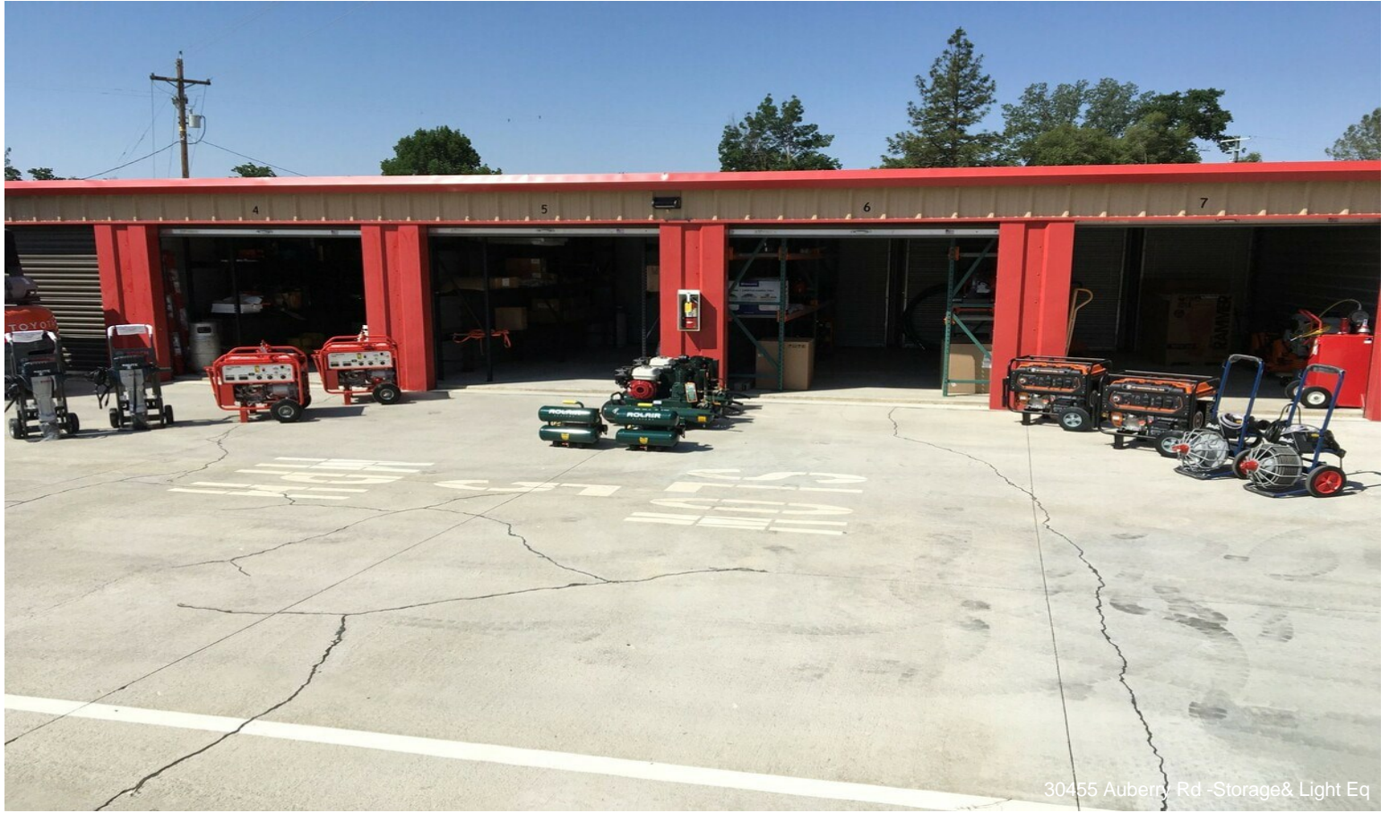
30455 Auberry Rd - Storage & Light Eq