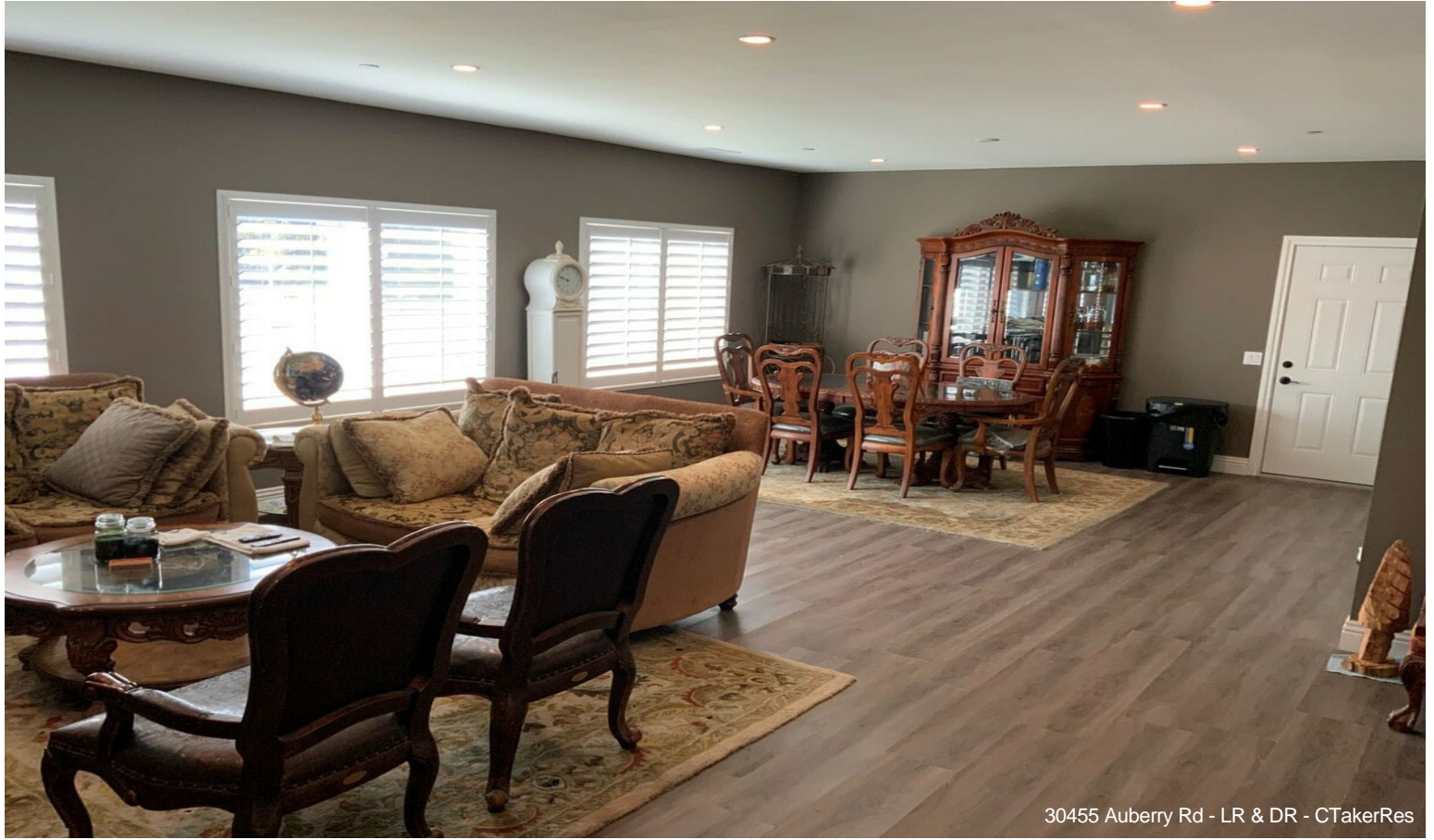
30455 Auberry Rd - LR & DR