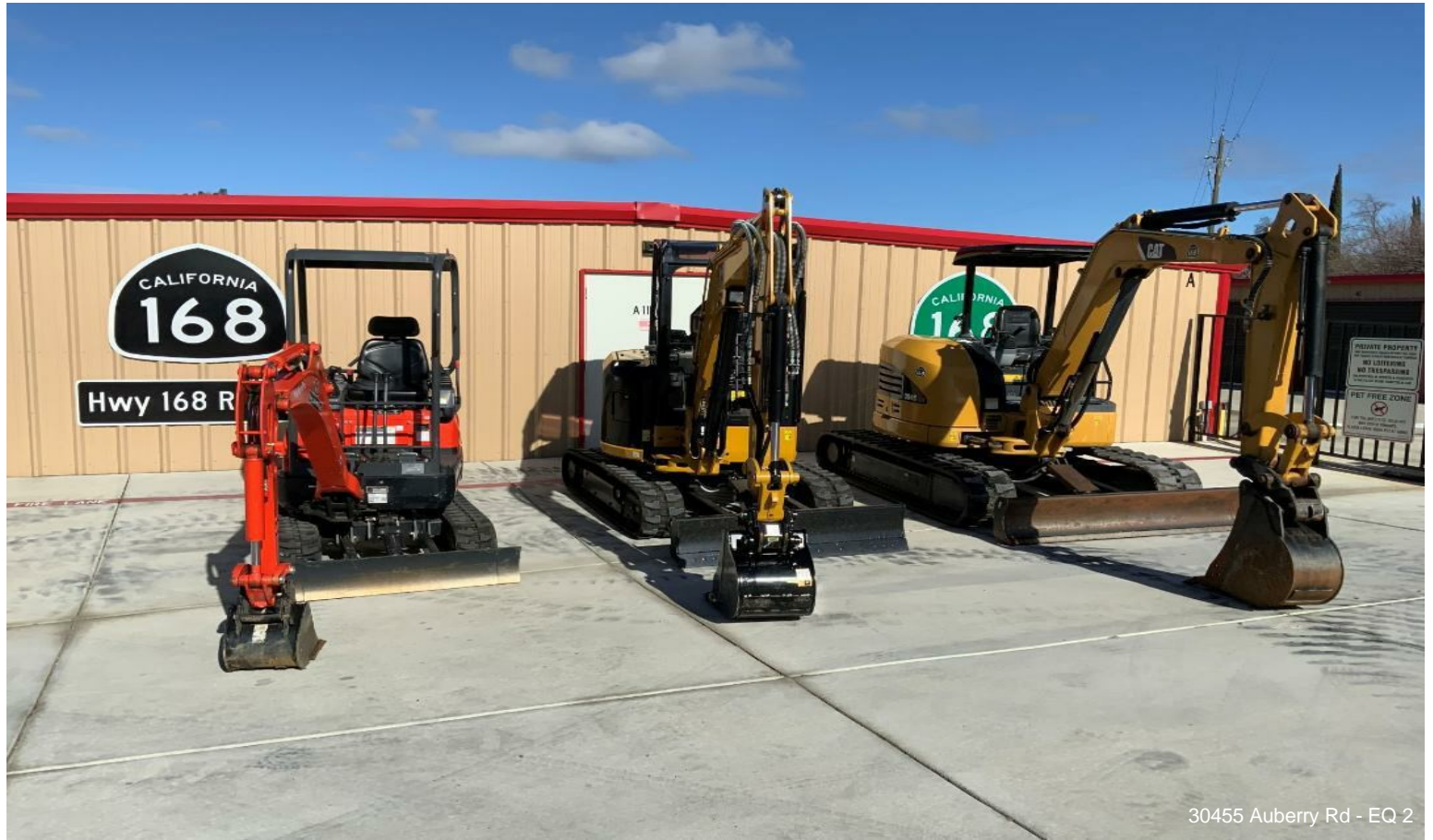
30455 Auberry Rd - EQ 2