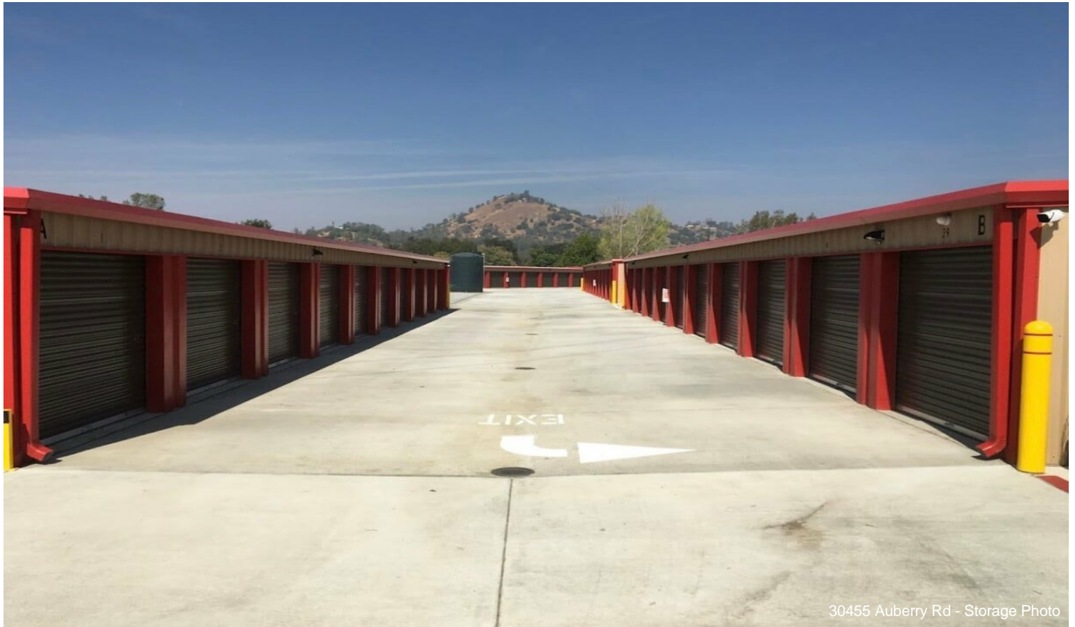
30455 Auberry Rd - Storage Photo