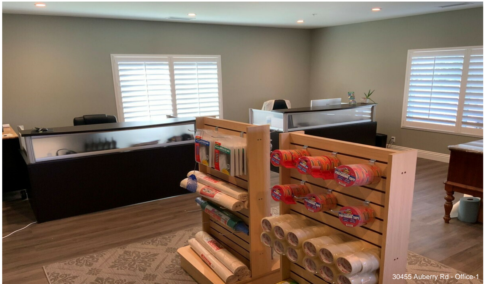
30455 Auberry Rd - Office-1