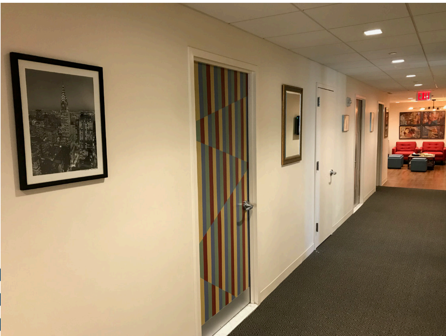
Hallway with two restrooms