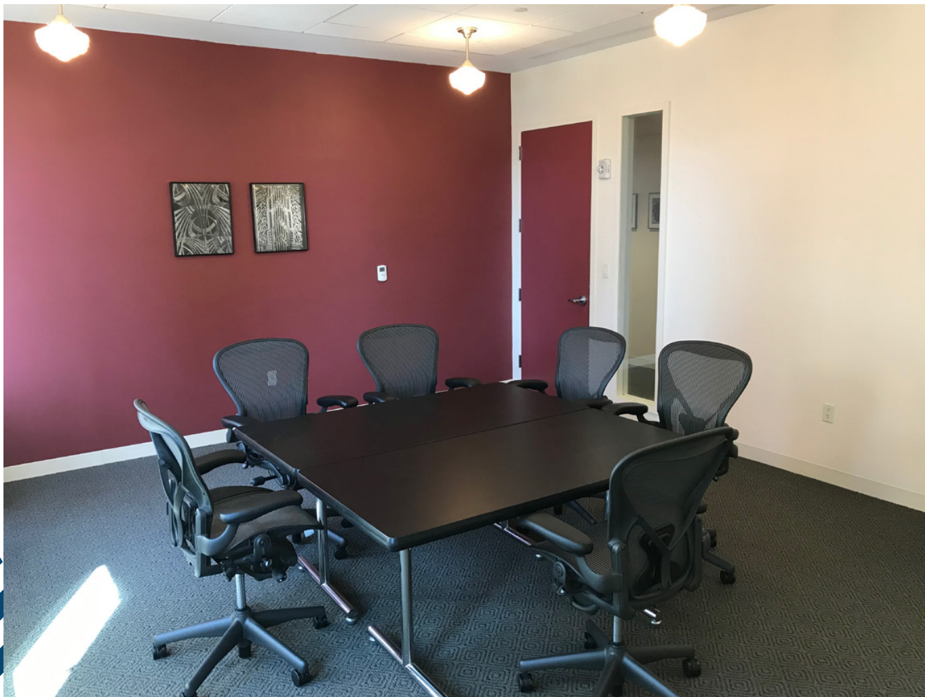
Red room 20' 1" x 17' 9"