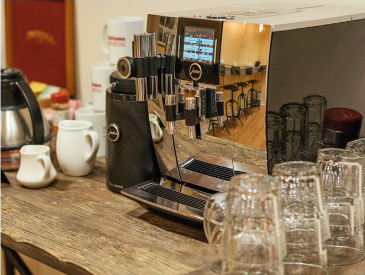
Tea, coffee, and espresso bar