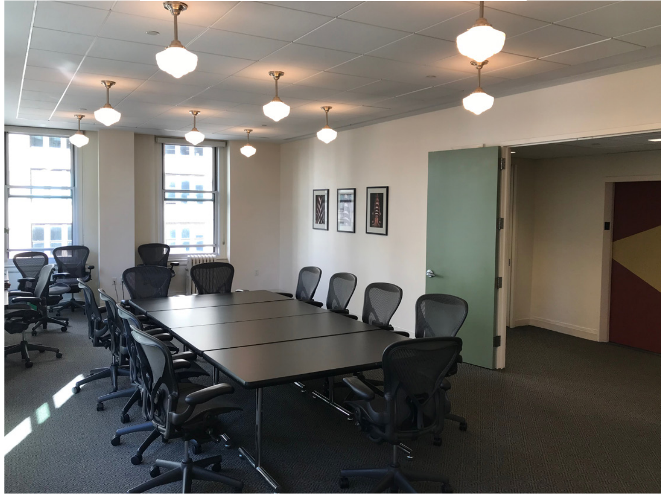
Green room north-west perspective