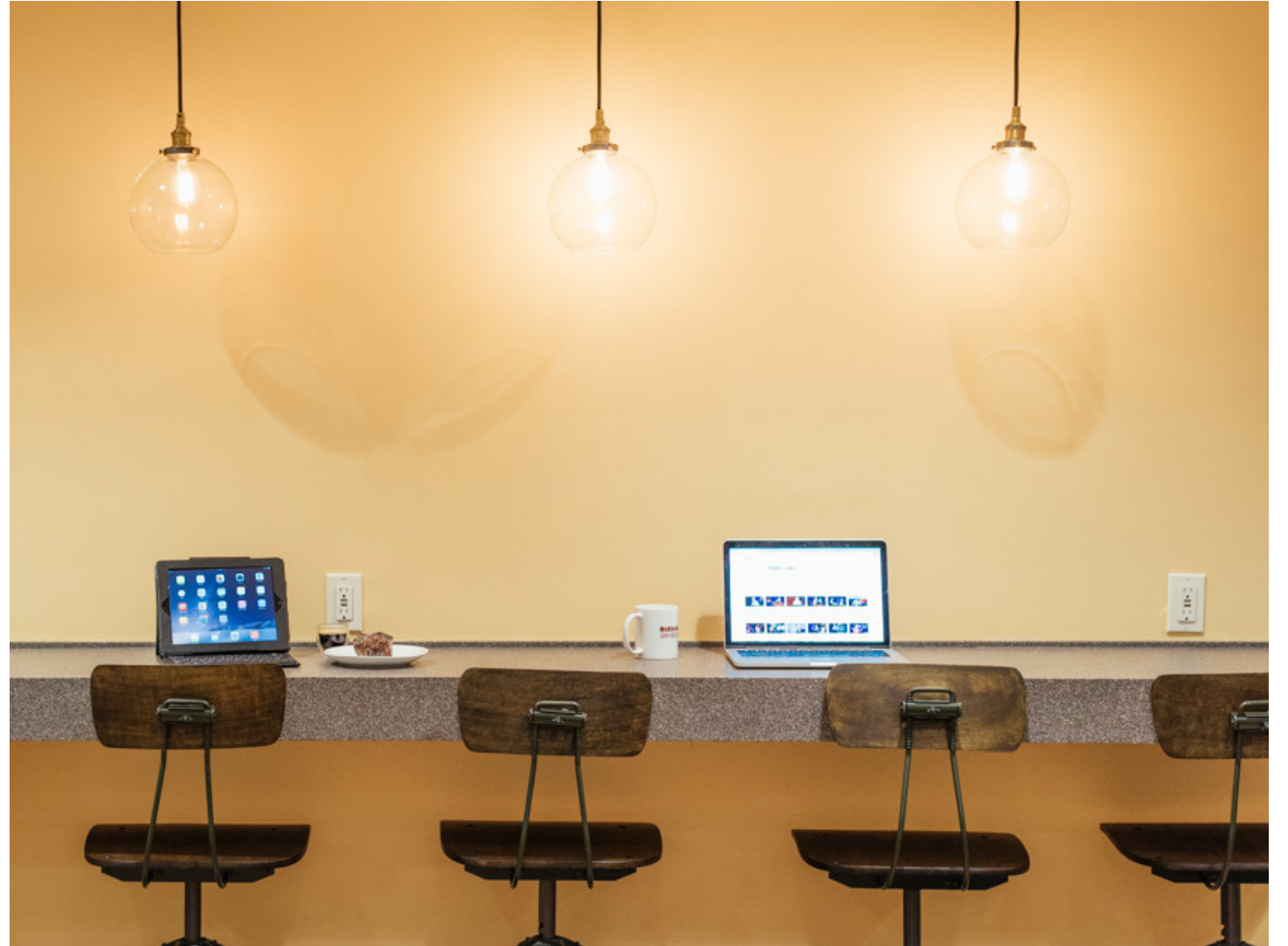
Counter with seating for four