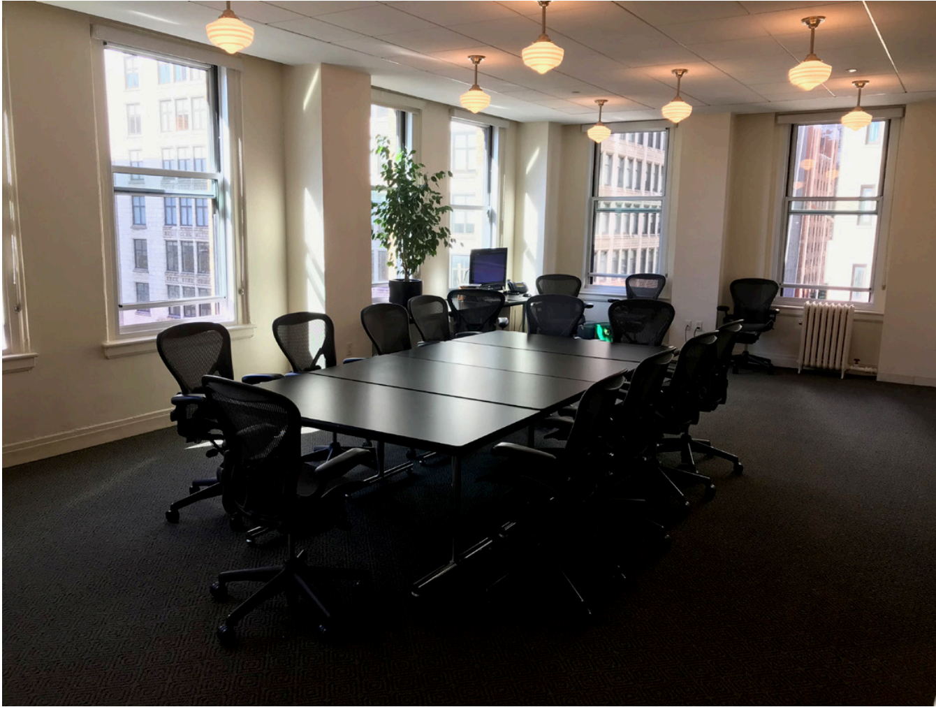
Green room 34' x 17' 9" south-west perspective